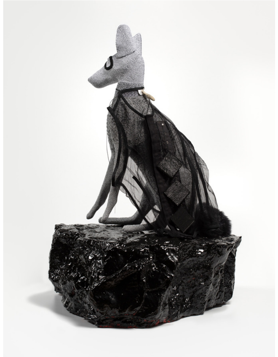
Moonlight becomes you (Silver Fox), 2001-2019 - Front and Verso