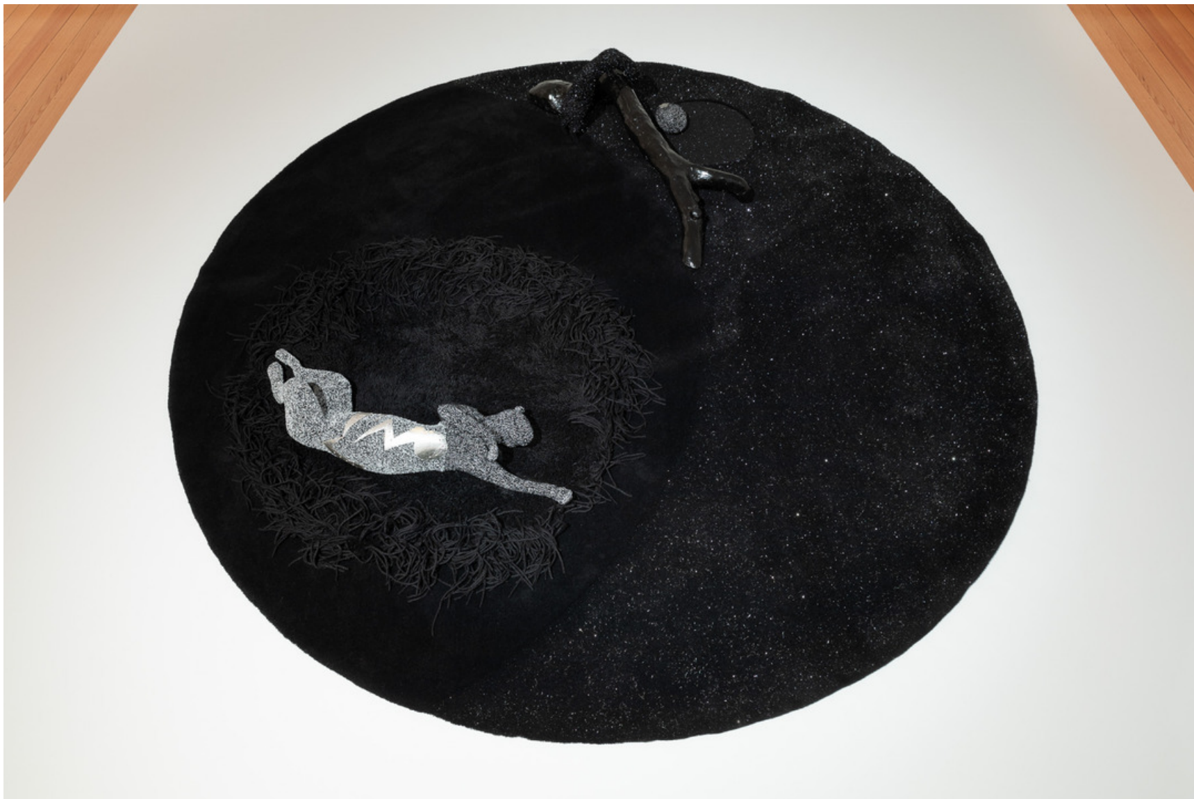
Moonlight becomes you , 2002-2003 - Installation view