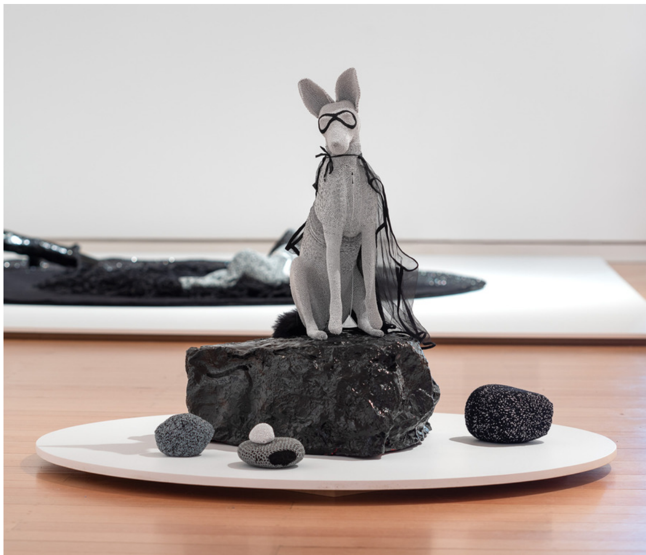
Moonlight becomes you (Silver Fox) , 2001-2019, (Fox) Hand crocheted cotton, Lurex, Viscose, Polyester, lamb's wool and high visibility (reflective) tape, over high-density foam, Papier-mâché, wire, mirrored Perspex, customised section of a Commes des Garçons shirt, Autumn-Winter collection 2004-2005, synthetic polymer emulsion, Swarovski crystals, Tyvek, nylon and artificial fur fabric. (Base) Fibreglass, enamel gloss paint and four hand crocheted covered stones (various fibres), Fox: 53 x 50 x 30 cm, Base: 20 x 54 x 45 cm (irregular), $25,000.00 [SOLD]