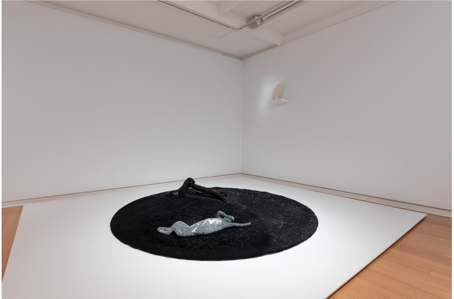
Moonlight becomes you , 2002-2003, bobcat: hand crocheted lambs wool and cotton embroidery thread over high density foam with silver painted pigskin and aluminium studs recouped from a 1980s Prue Acton garment, carpet, cast resin tree limb and mink: hand crocheted polyamide thread and lambs wool over high density foam, cotton thread. 3 m diameter, [SOLD]