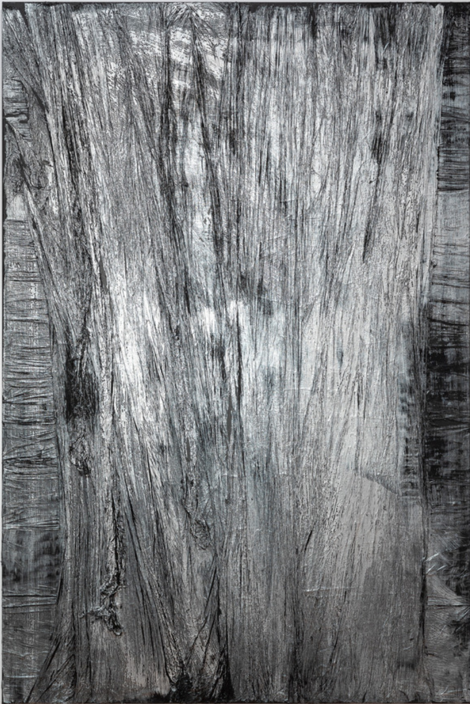
Spirit Level , 2015 synthetic polymer emulsion on linen 183 x 122 cm $19,800.00