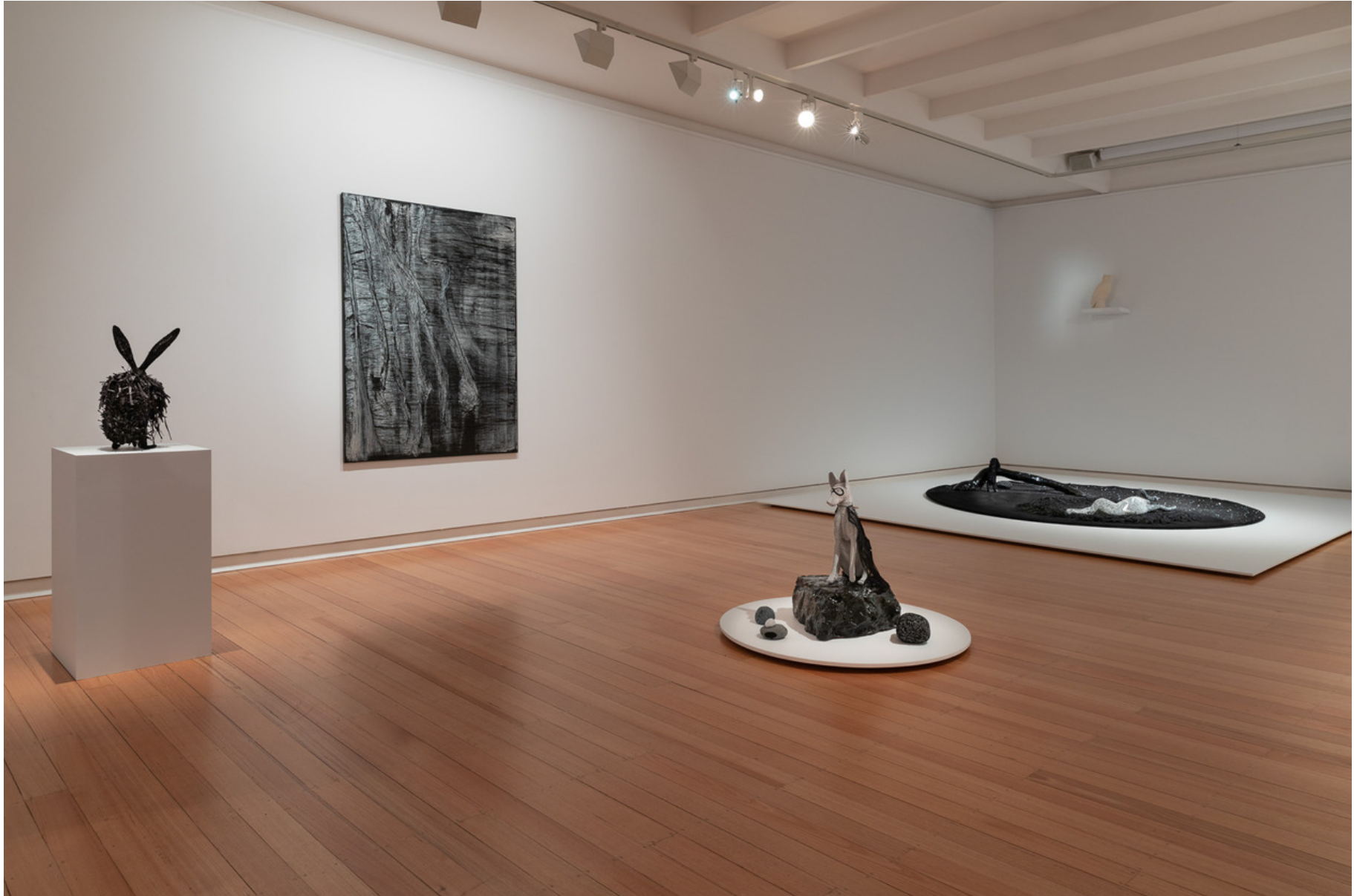
The Moon - Installation view