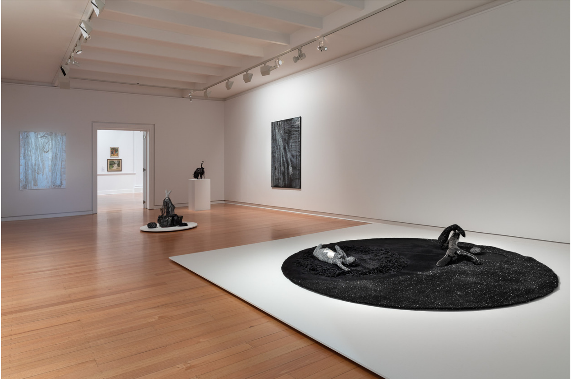
The Moon - Installation view