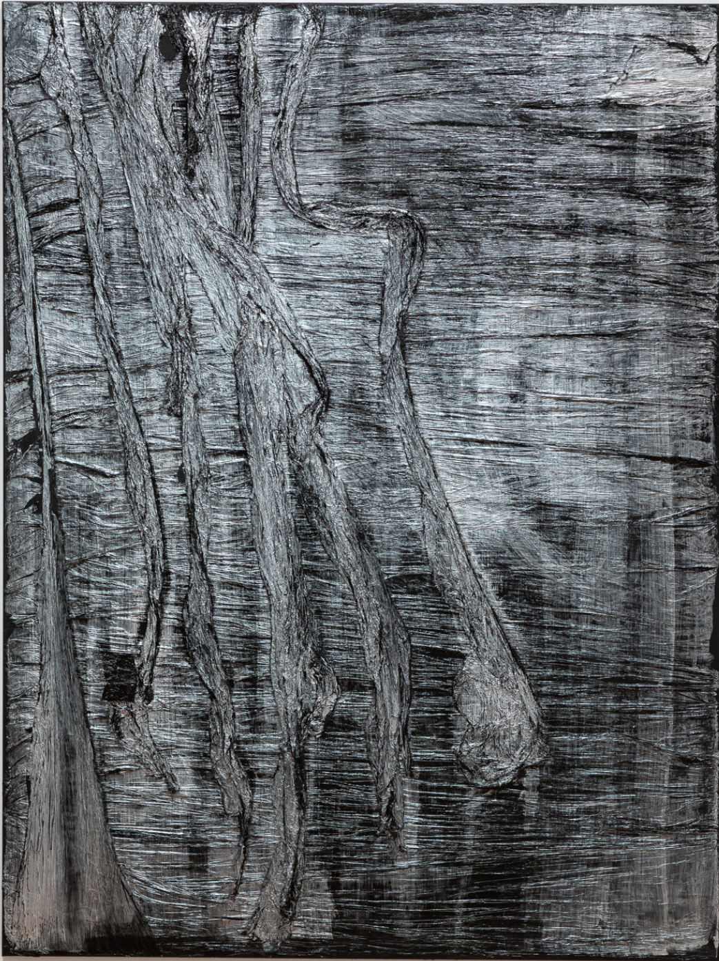
Dark Spring , 2015 synthetic polymer emulsion on linen 183 x 137.2 cm $19,800.00 [SOLD]