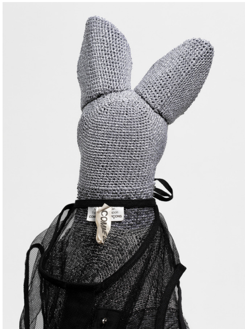
Moonlight becomes you (Silver Fox), 2001-2019 - Details