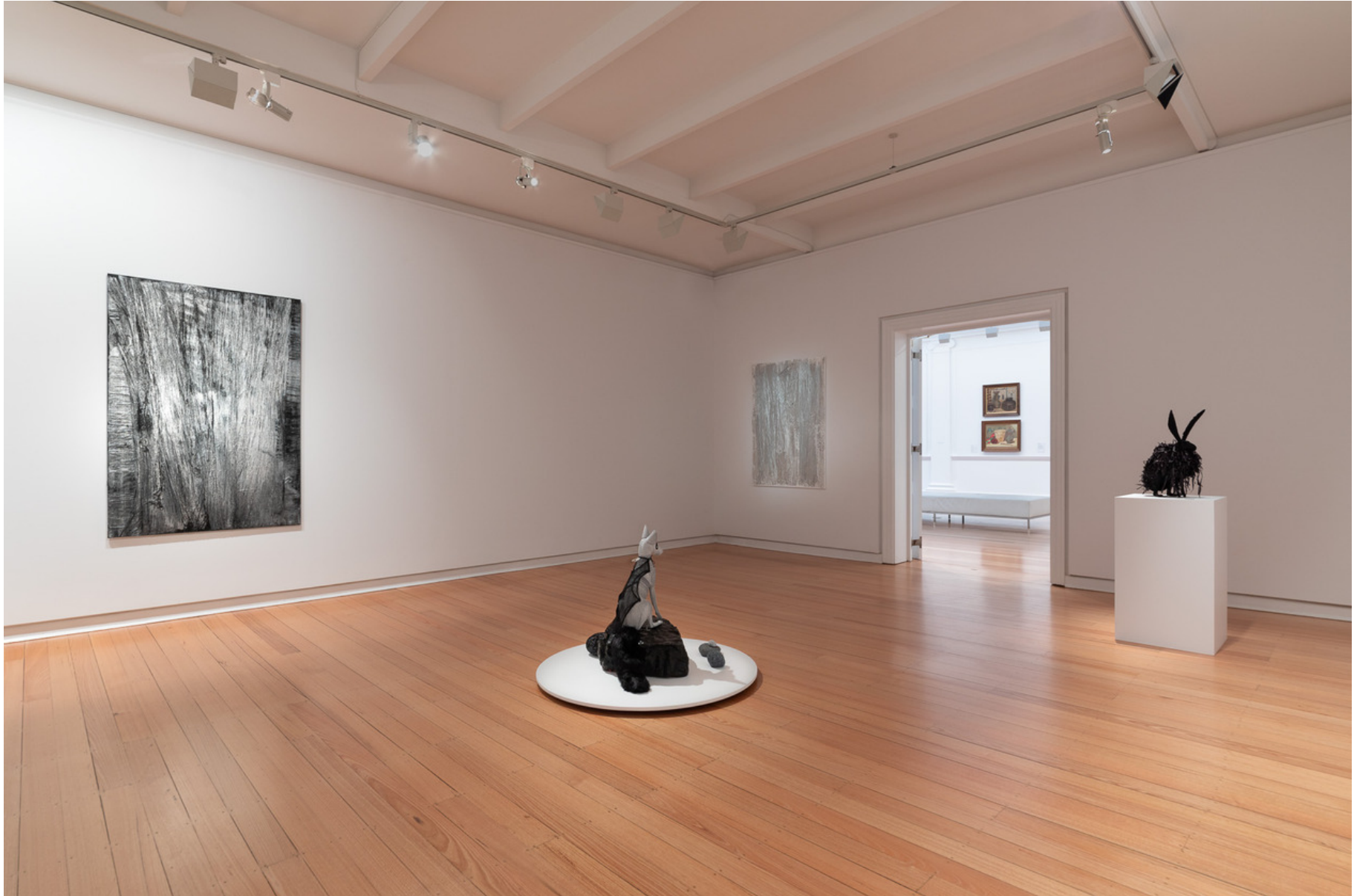
The Moon - Installation view