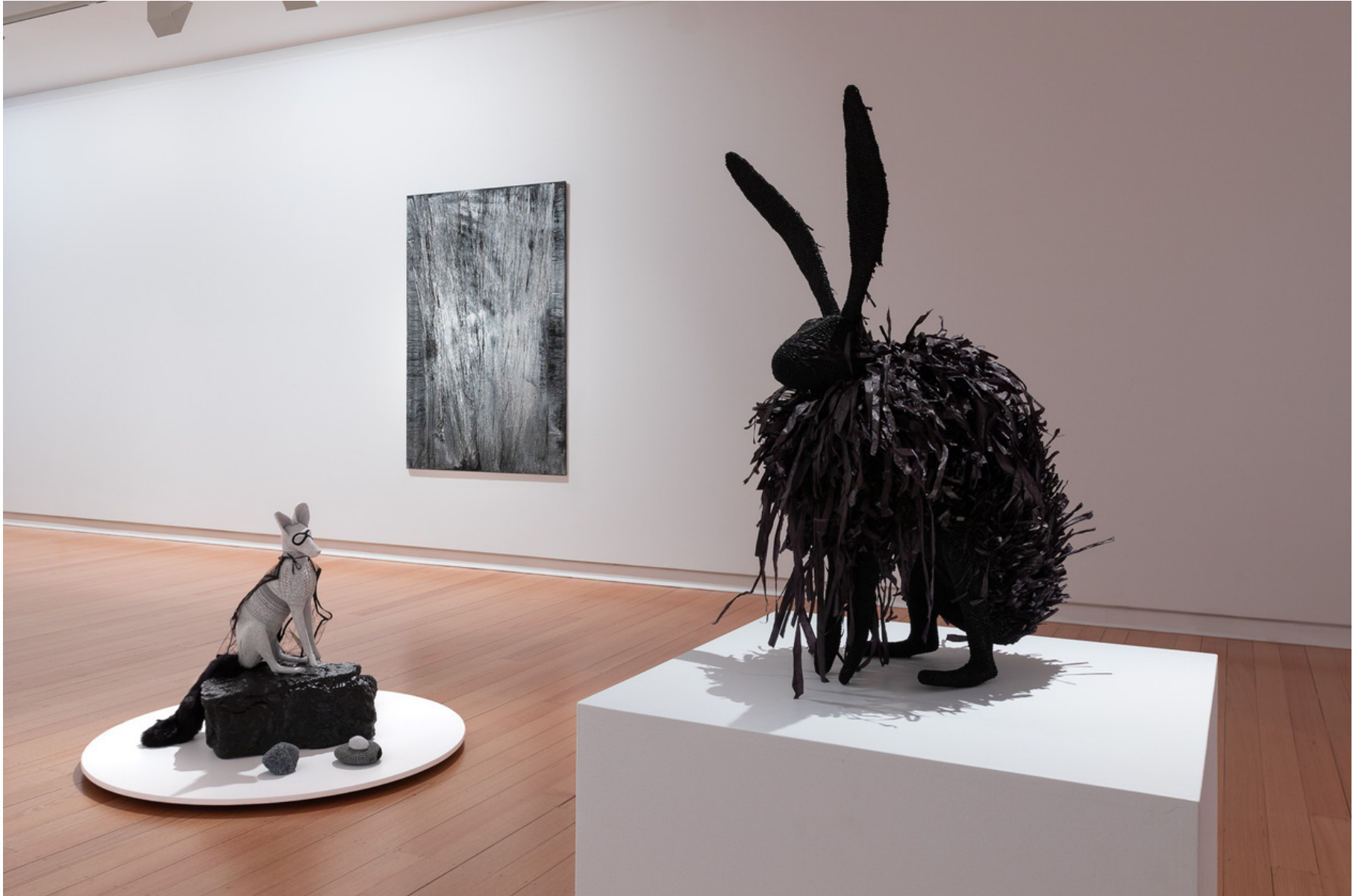
The Moon - Installation view