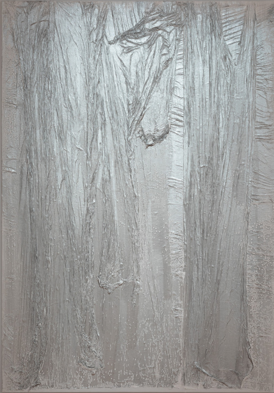
Silvering (Moon Dust) , 2019 synthetic polymer emulsion and glitter on linen 152 x 106 cm $15,500.00