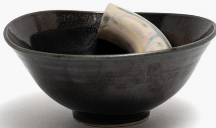
Bowel (2) 2023 stoneware with glaze & porcelain slip 6 x 14 x 13 cm $1,000.00