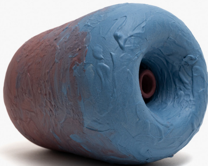
Self Receiving 2023 stoneware with porcelain slip 15 x 13 x 13 cm $1,500.00