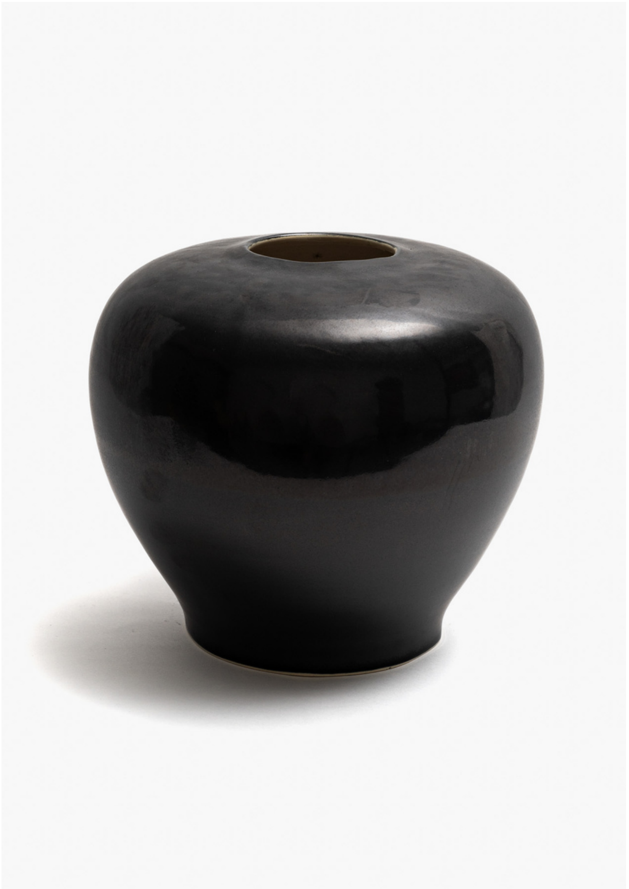
Unidentified Feeling Object 2023 stoneware with glaze & porcelain slip 25 x 28 x 28 cm $2,200.00