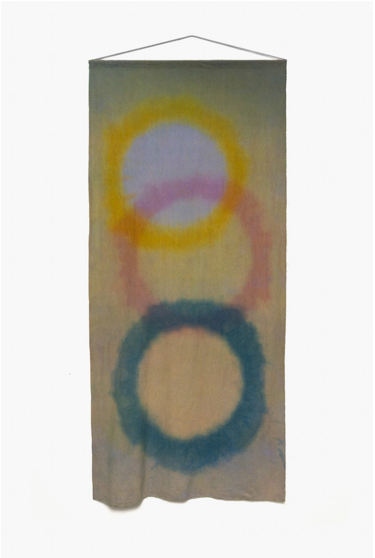
Opening (5) 2024 canvas & synthetic dye 188 x 88 cm $3,500.00