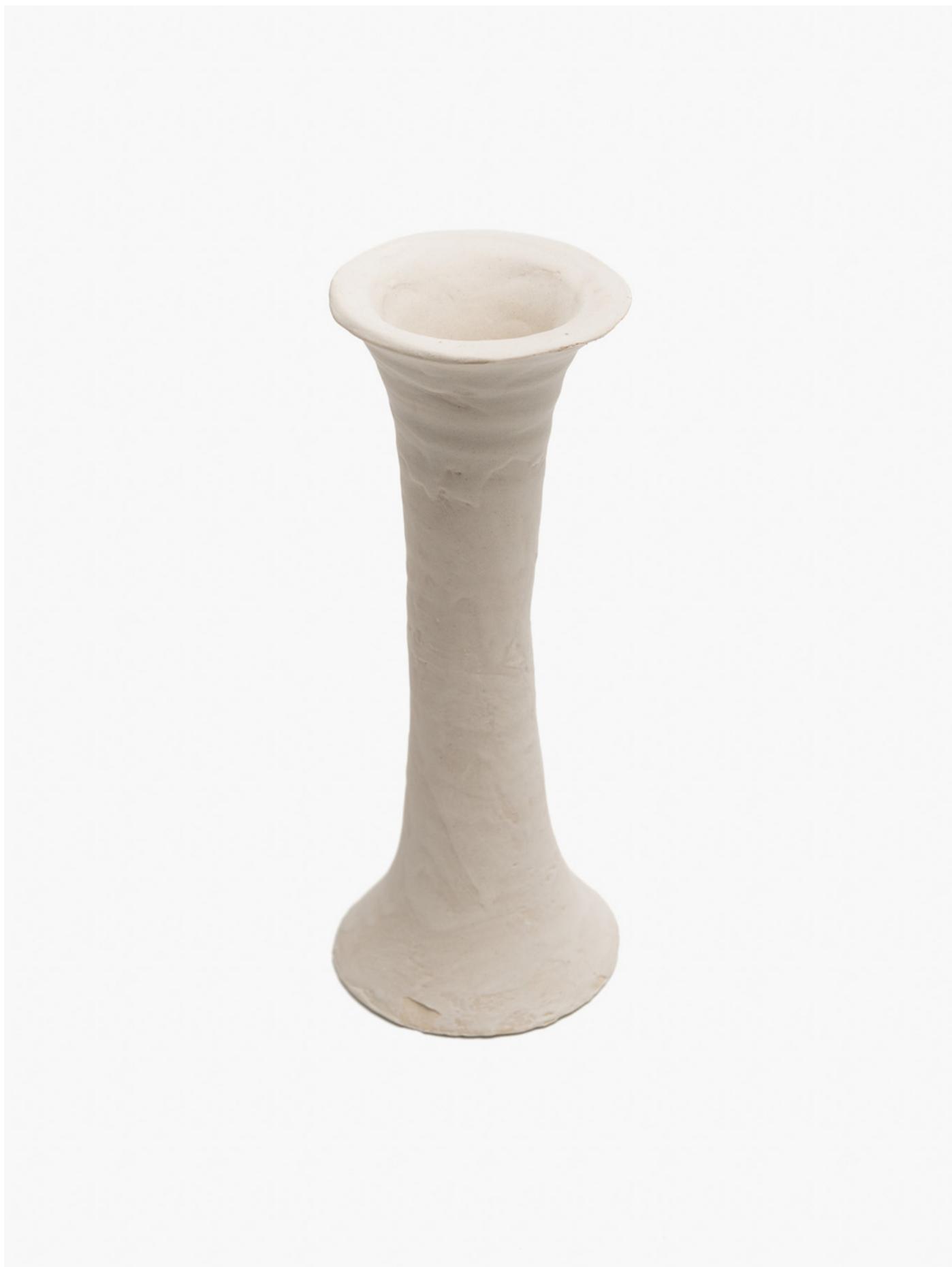
Universal Feet 2023 stoneware with porcelain slip 21 x 8 x 9 cm $1,000.00