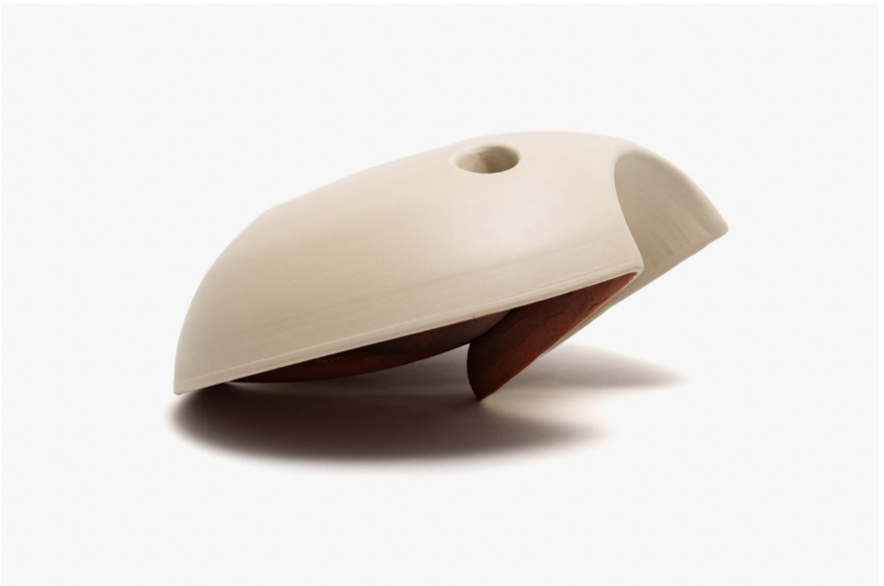
Time (2) 2024 stoneware with porcelain slip 32 x 32 x 14 cm $2,200.00