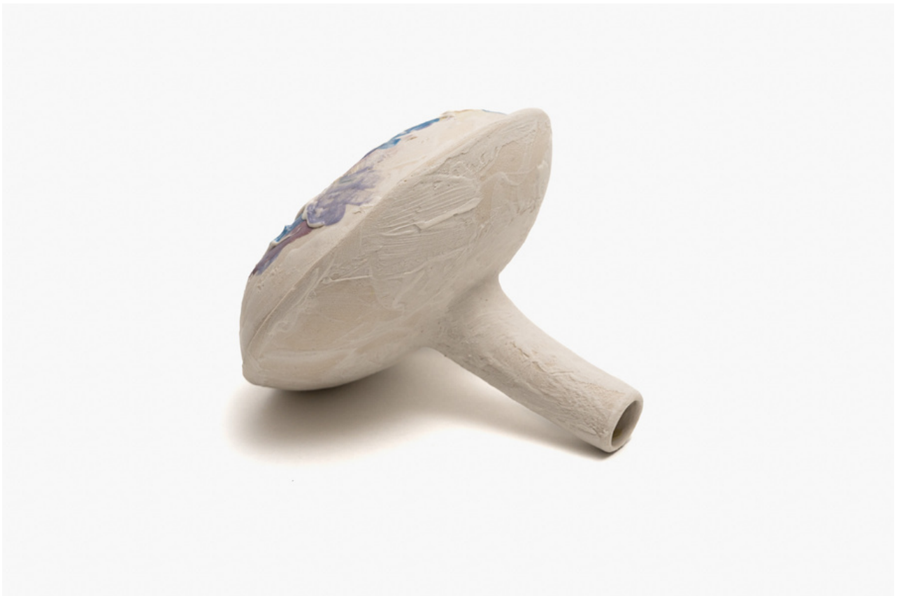
Spout Disjoint 2023 stoneware with porcelain slip 10 x 14 x 13 cm $1,000.00