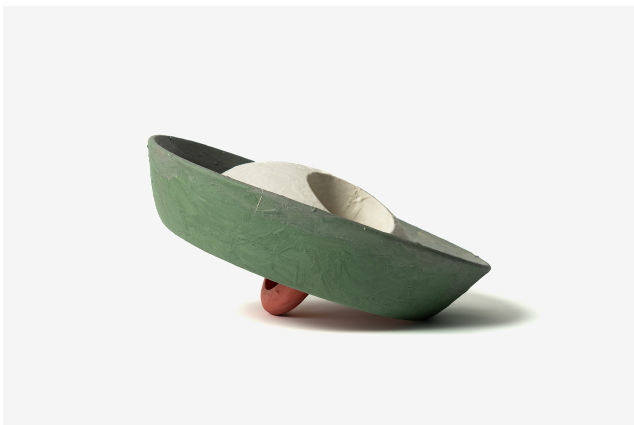
Side Lie Join 2023 stoneware with porcelain slip 15 x 32 x 32 cm $2,500.00