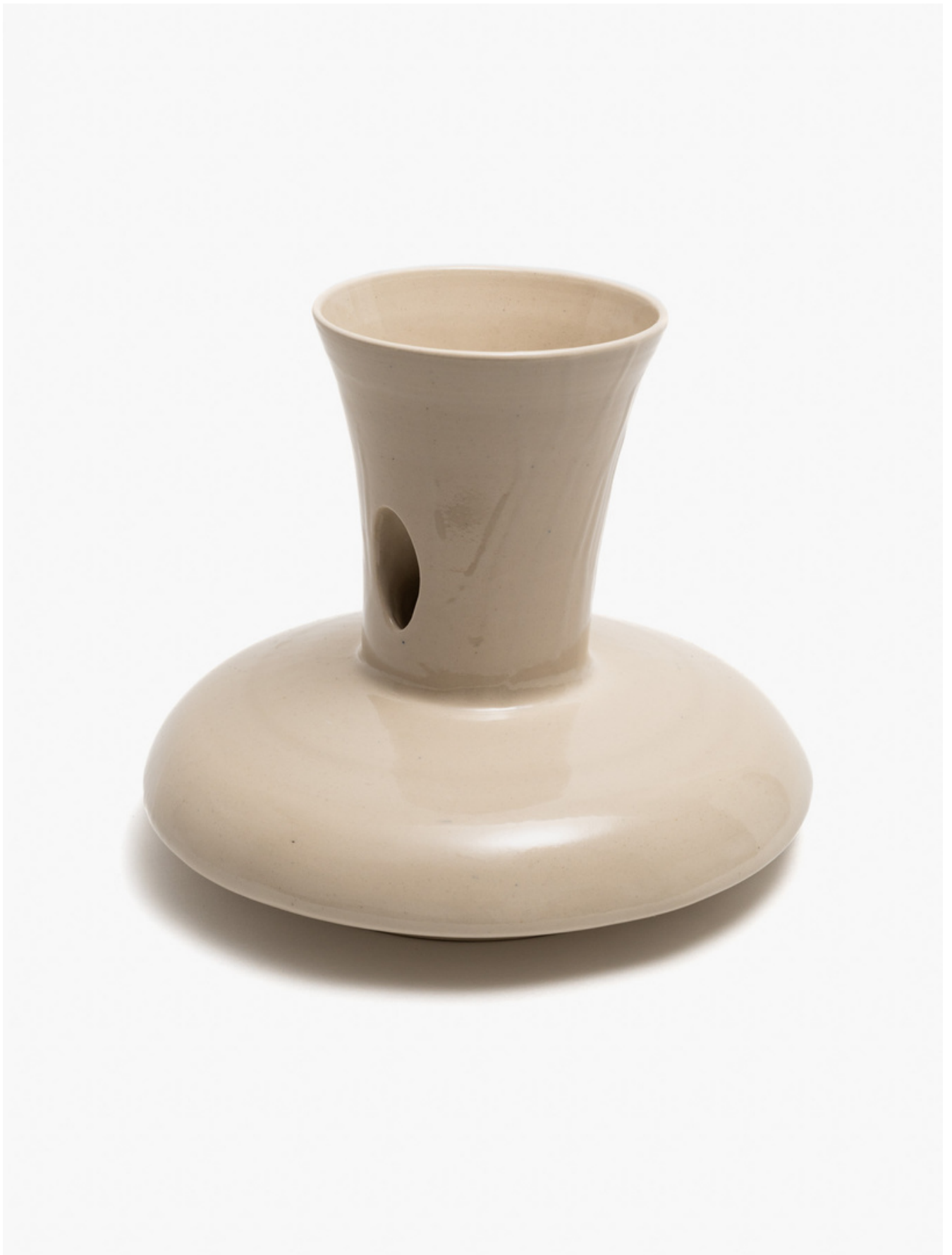
Bypass Vessel 2023 stoneware with glaze 23 x 27 x 27 cm $2,000.00