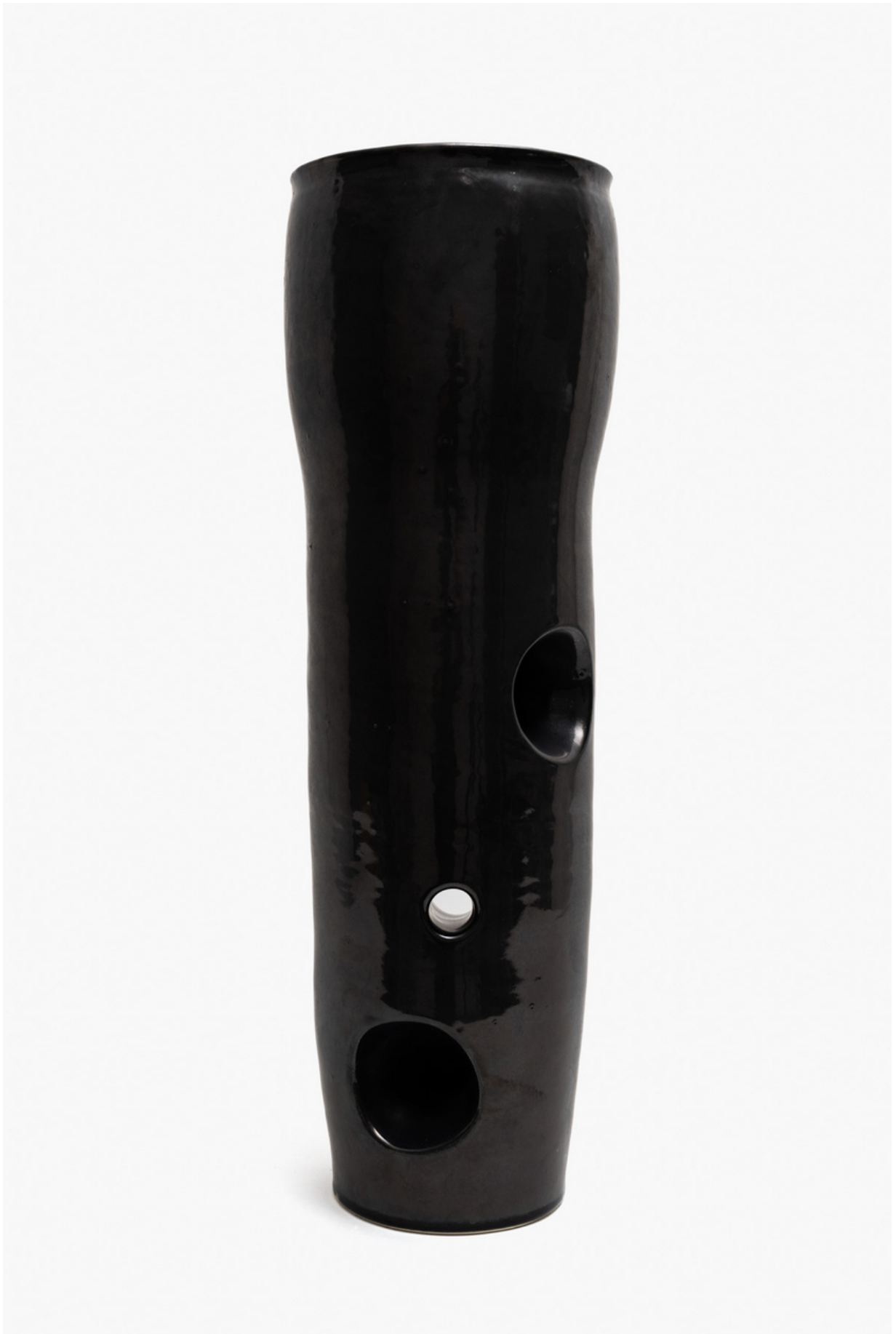
Connecting Object 2024 stoneware with glaze 61 x 19 x 19 cm $3,500.00