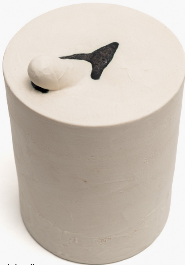
Felt Through 2023 stoneware with glaze & porcelain slip 23 x 16 x 16 cm $2,000.00