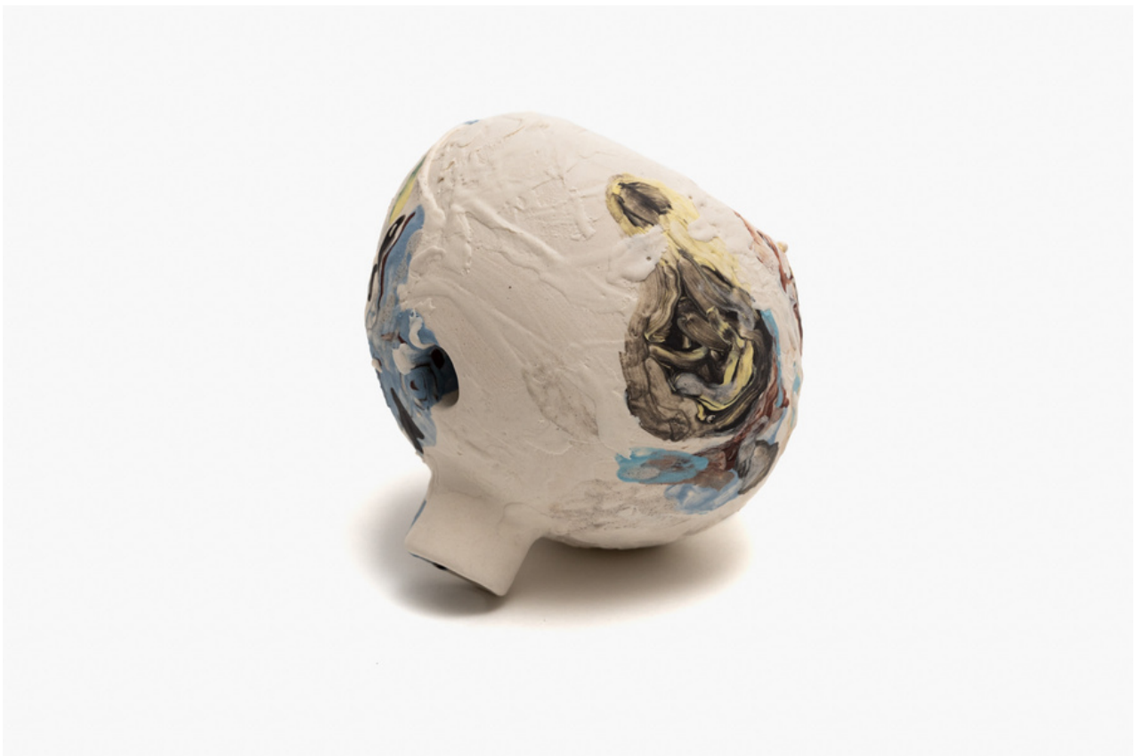
Spout Through 2023 stoneware with porcelain slip 12 x 13 x 14 cm $1,000.00