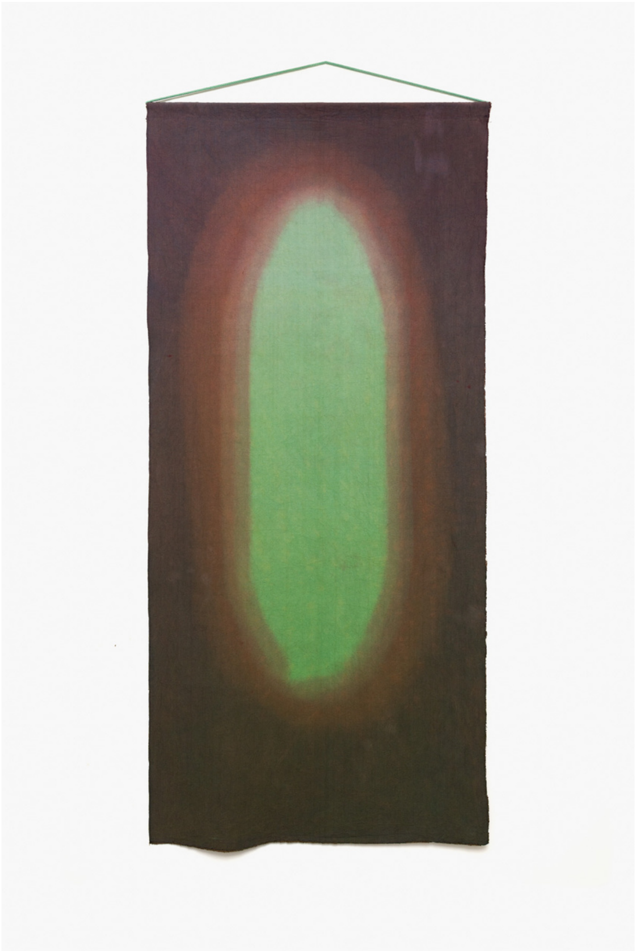
Opening (2) 2023 canvas & synthetic dye 190 x 89 cm $3,500.00