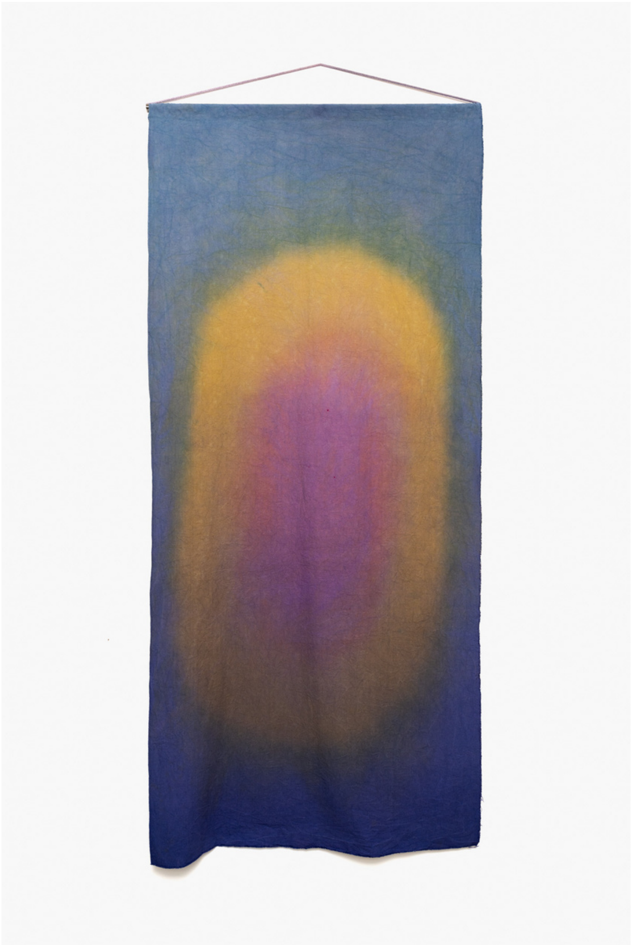
Opening (1) 2023 canvas & synthetic dye 188 x 88 cm $3,500.00