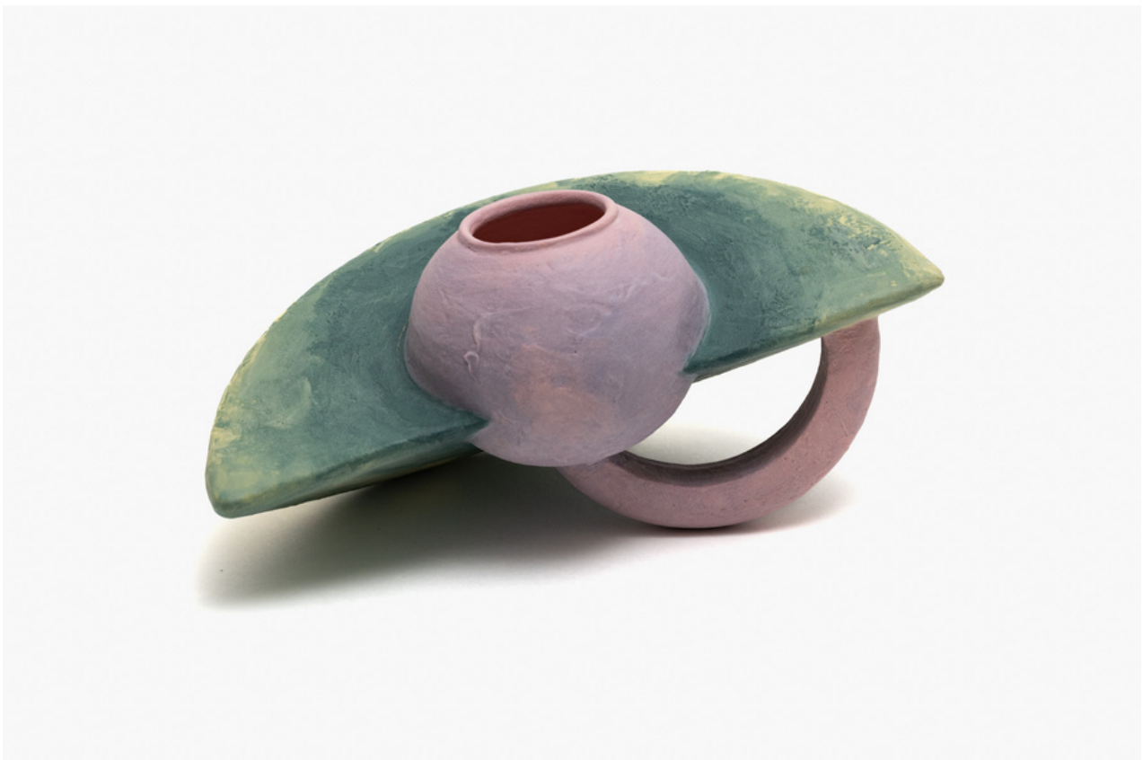
In and Out of Earth 2023 stoneware with porcelain slip 13 x 23 x 11 cm $1,500.00