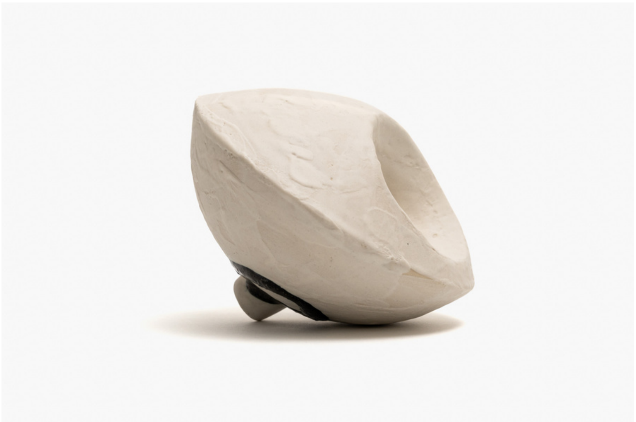
Universal Object 2023 stoneware with glaze & porcelain slip 9 x 14 x 14 cm $1,250.00