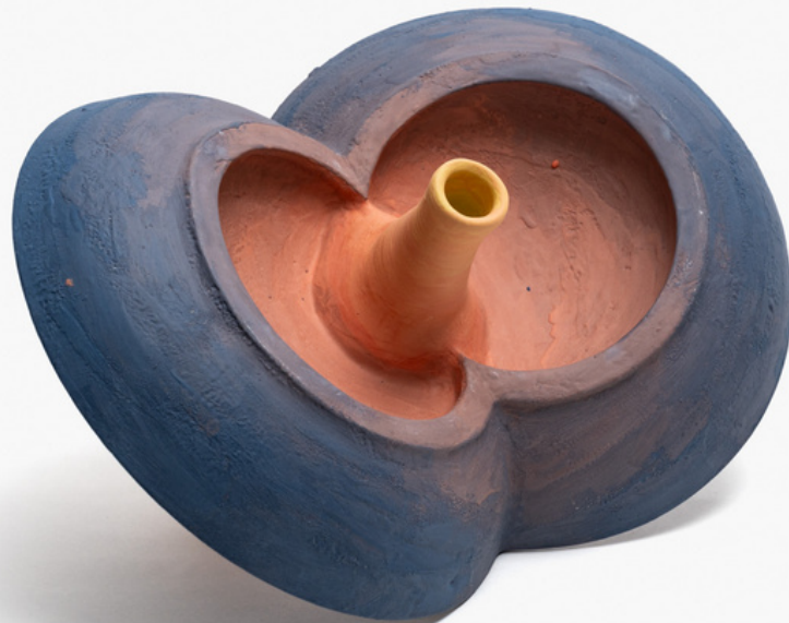
Expropriate Form 2023 stoneware with porcelain slip 22 x 40 x 28 cm $2,500.00