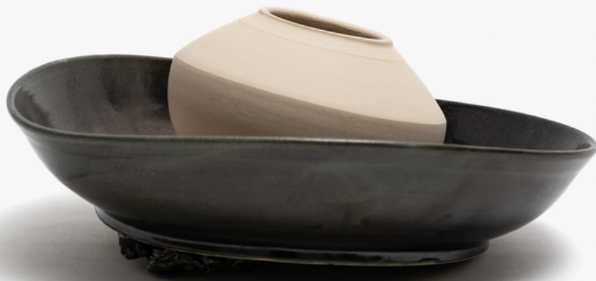
Practice Breath Hiccup 2023 stoneware with glaze & porcelain slip 2 pieces, 12 x 29 x 27 cm $2,200.00