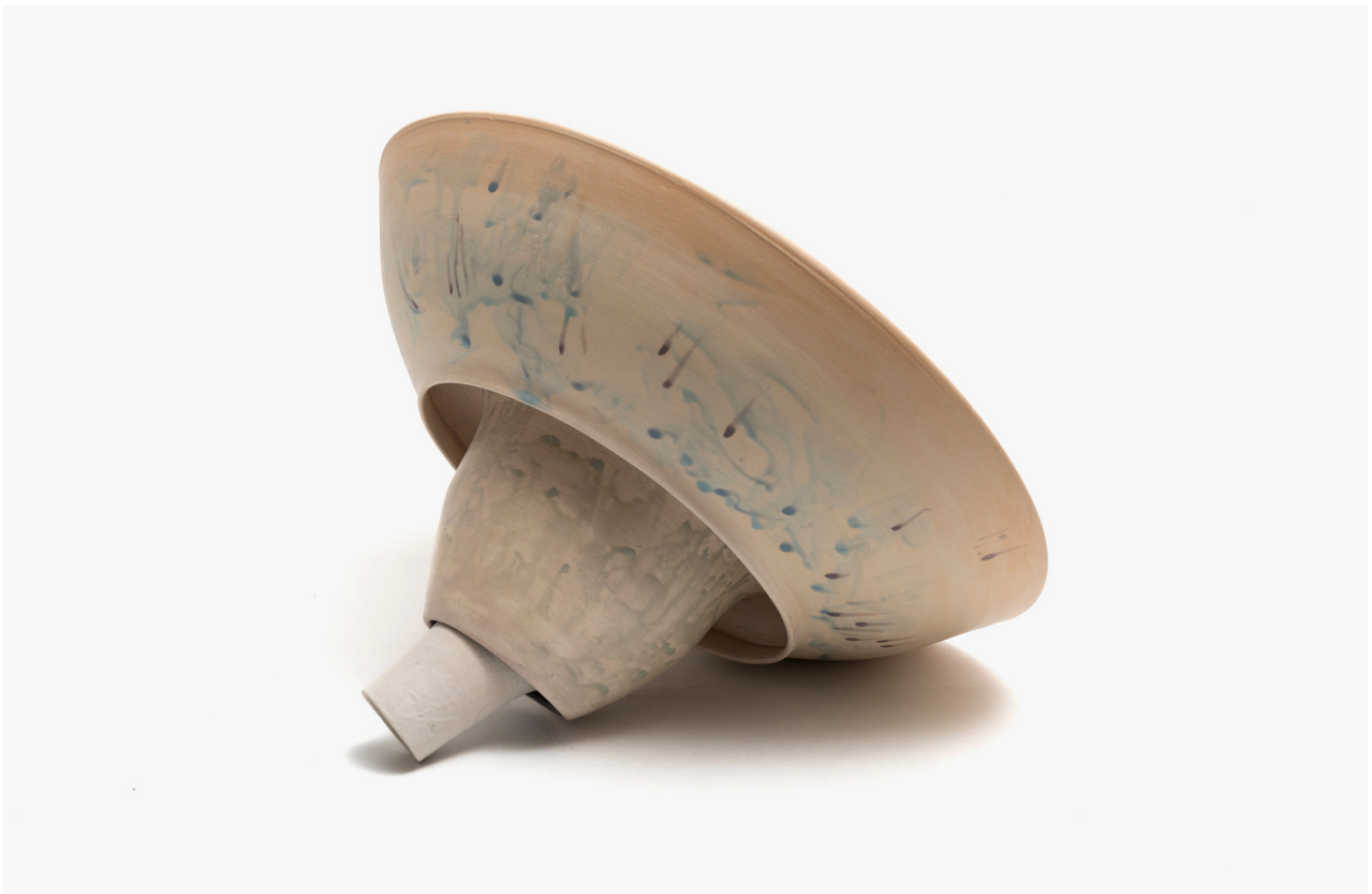
Partial Recognition 2023 stoneware with porcelain slip 24 x 37 x 27 cm $2,500.00