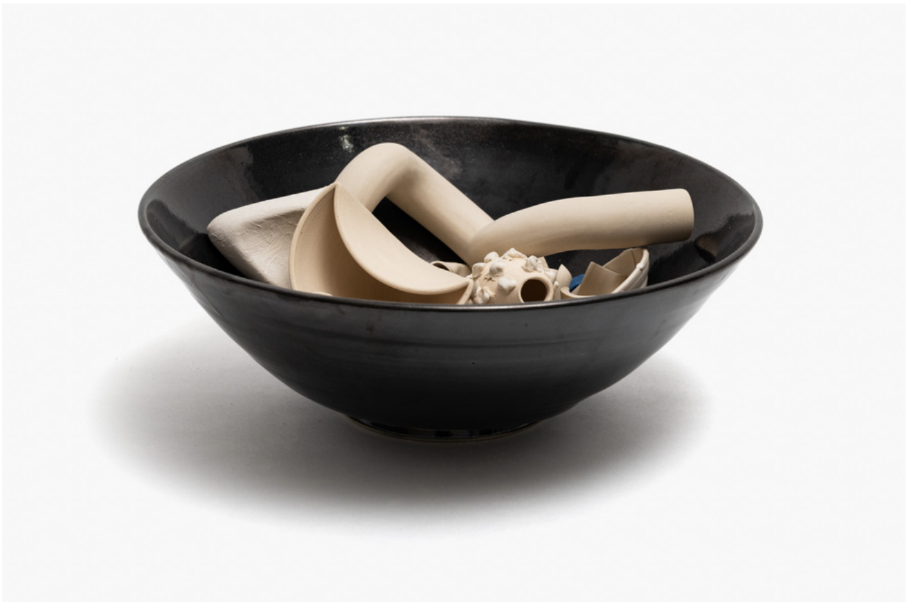
Finger Spaces 2024 stoneware with glaze 12 x 33 x 34 cm $2,500.00