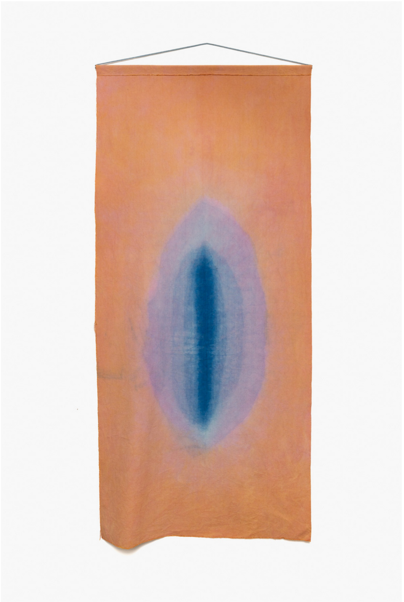
Opening (6) 2024 canvas & synthetic dye 188 x 88 cm $3,500.00