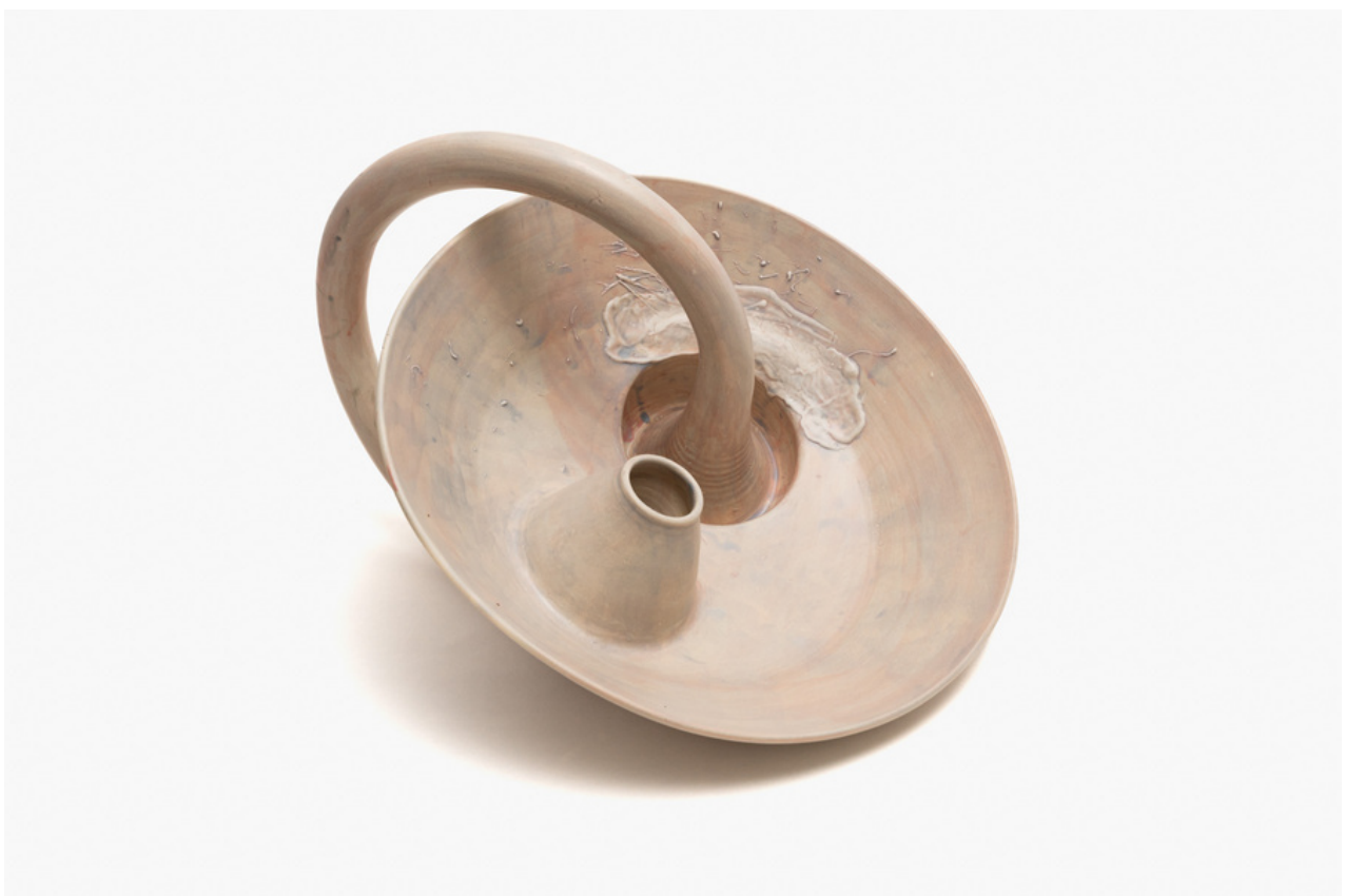
Feed Loop 2024 stoneware with porcelain slip 25 x 40 x 35 cm $2,500.00