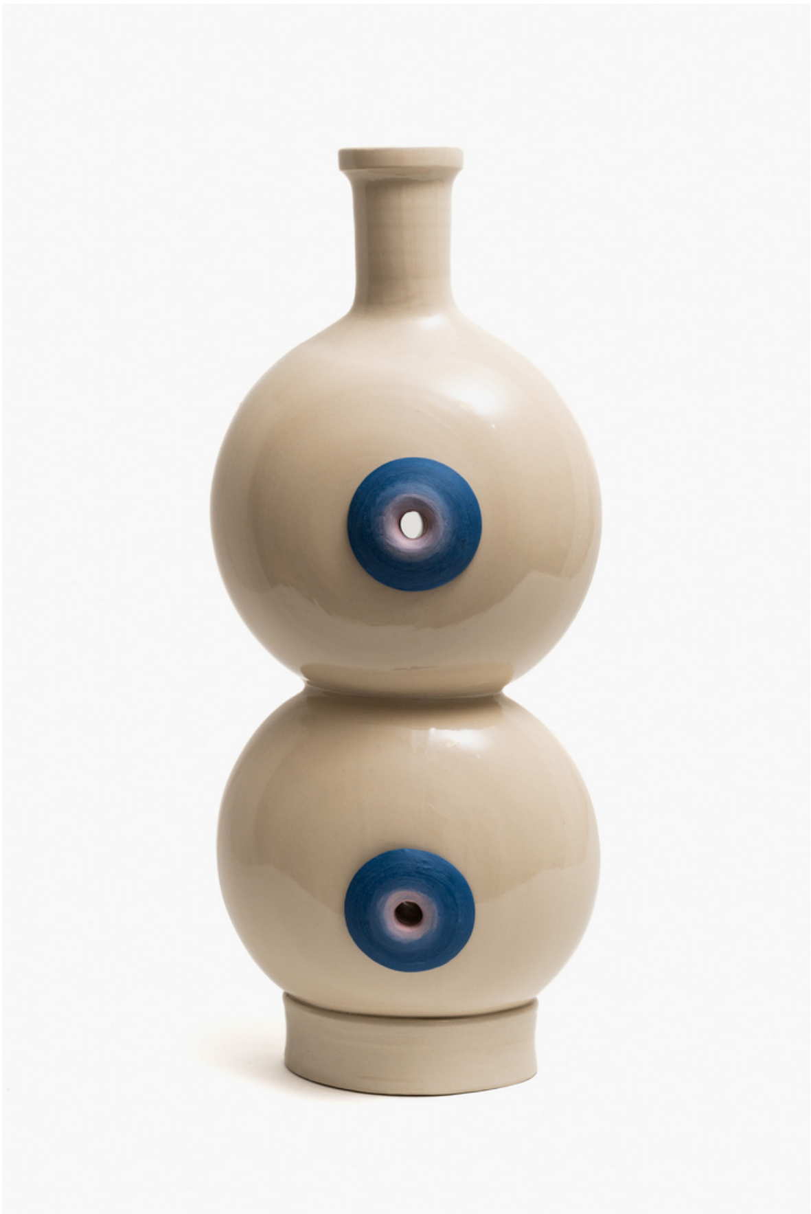
Double Anti 2023 stoneware with glaze & porcelain slip 58 x 25 x 18 cm $3,500.00