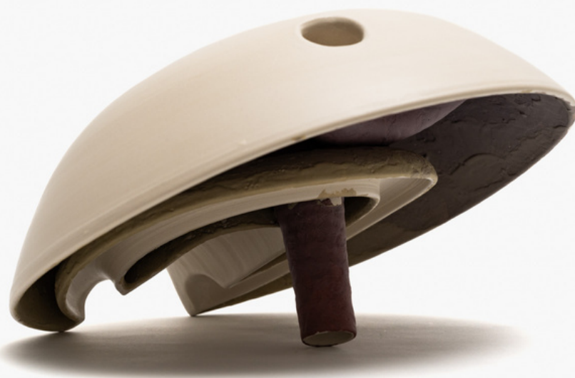
Time (1) 2024 stoneware with porcelain slip 31 x 31 x 16 cm $2,200.00