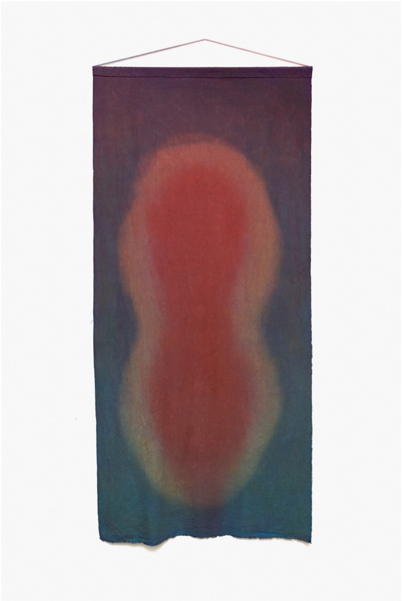
Opening (3) 2023 canvas & synthetic dye 184 x 88 cm $3,500.00