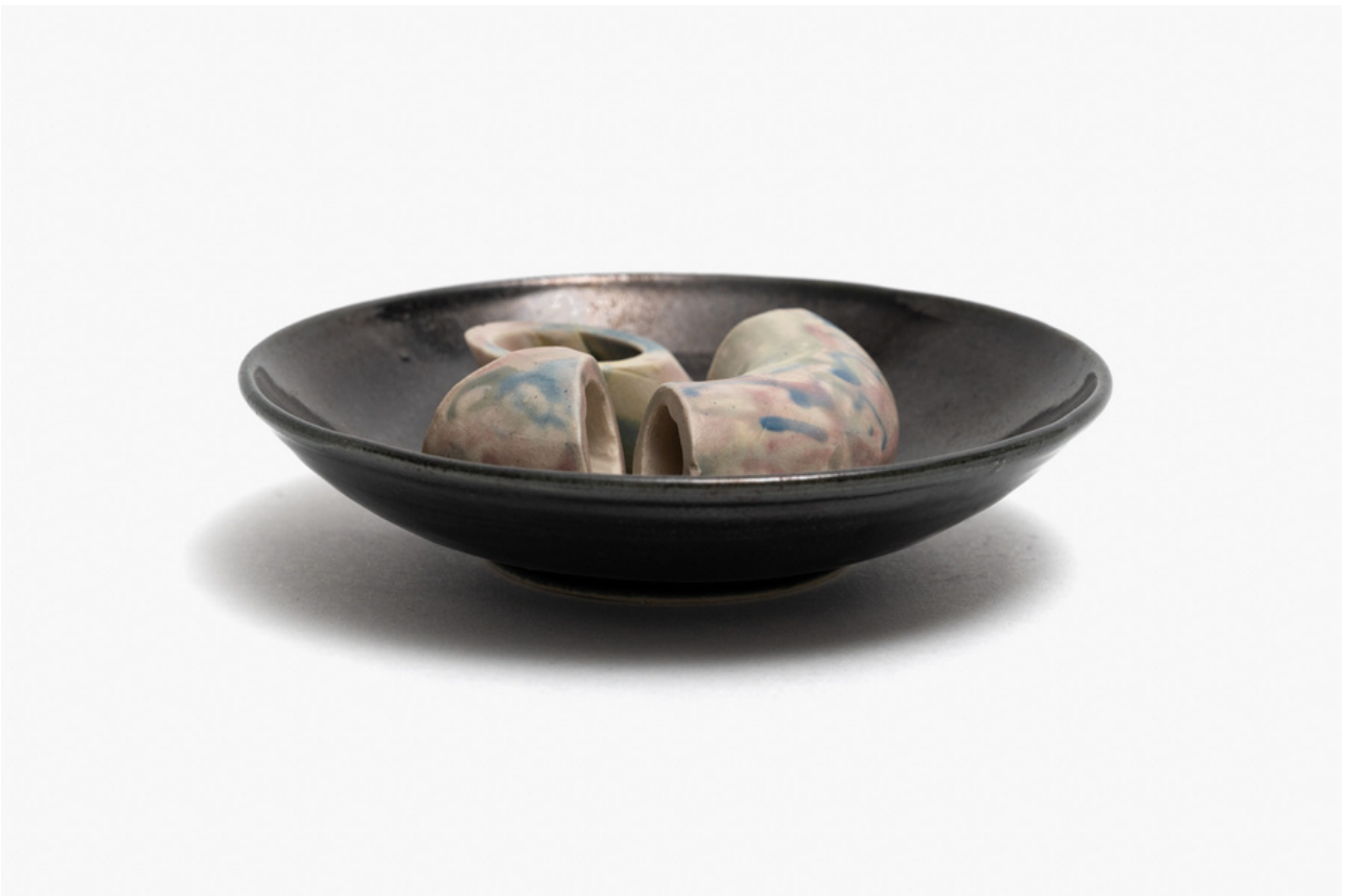
Bowel (3) 2024 stoneware with glaze & porcelain slip 4 x 13 x 13 cm $1,000.00