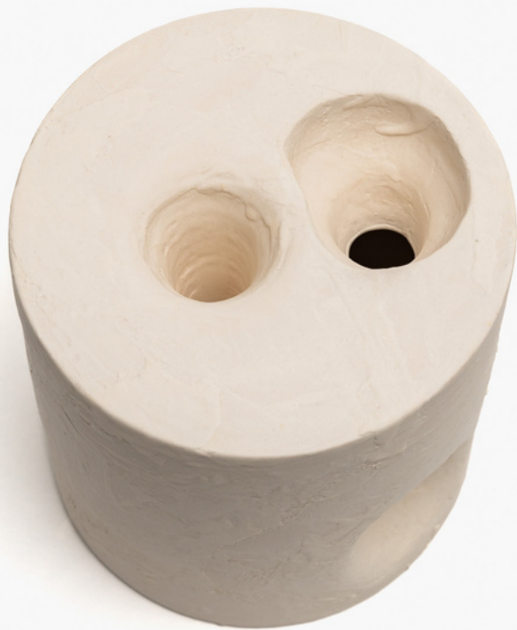
Image Structure 2023 stoneware with porcelain slip 18 x 16 x 16 cm $1,800.00 RESERVED