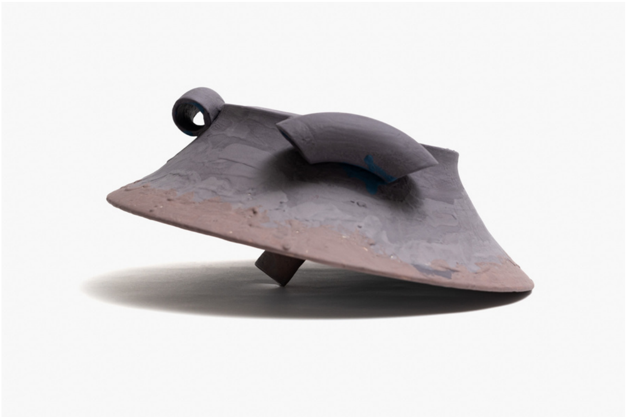
Nipple Eyeball Proboscis (Part Of An) Egg 2024 stoneware with porcelain slip 31 x 31 x 14 cm $2,200.00