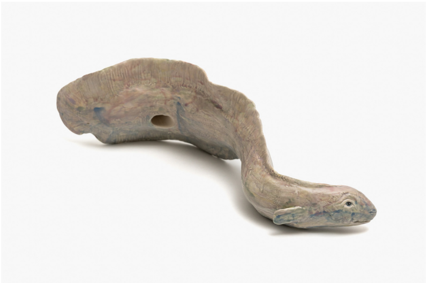
First Sham 2023 stoneware with porcelain slip 12 x 40 x 19 cm $2,500.00 RESERVED