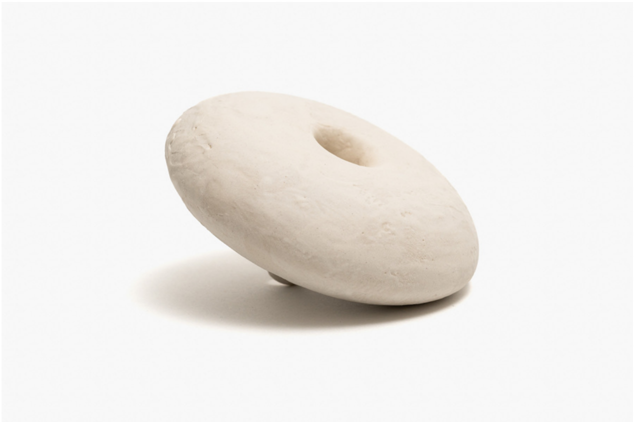
Opening Stone 2023 stoneware with glaze & porcelain slip 6 x 11 x 11 cm $1,250.00