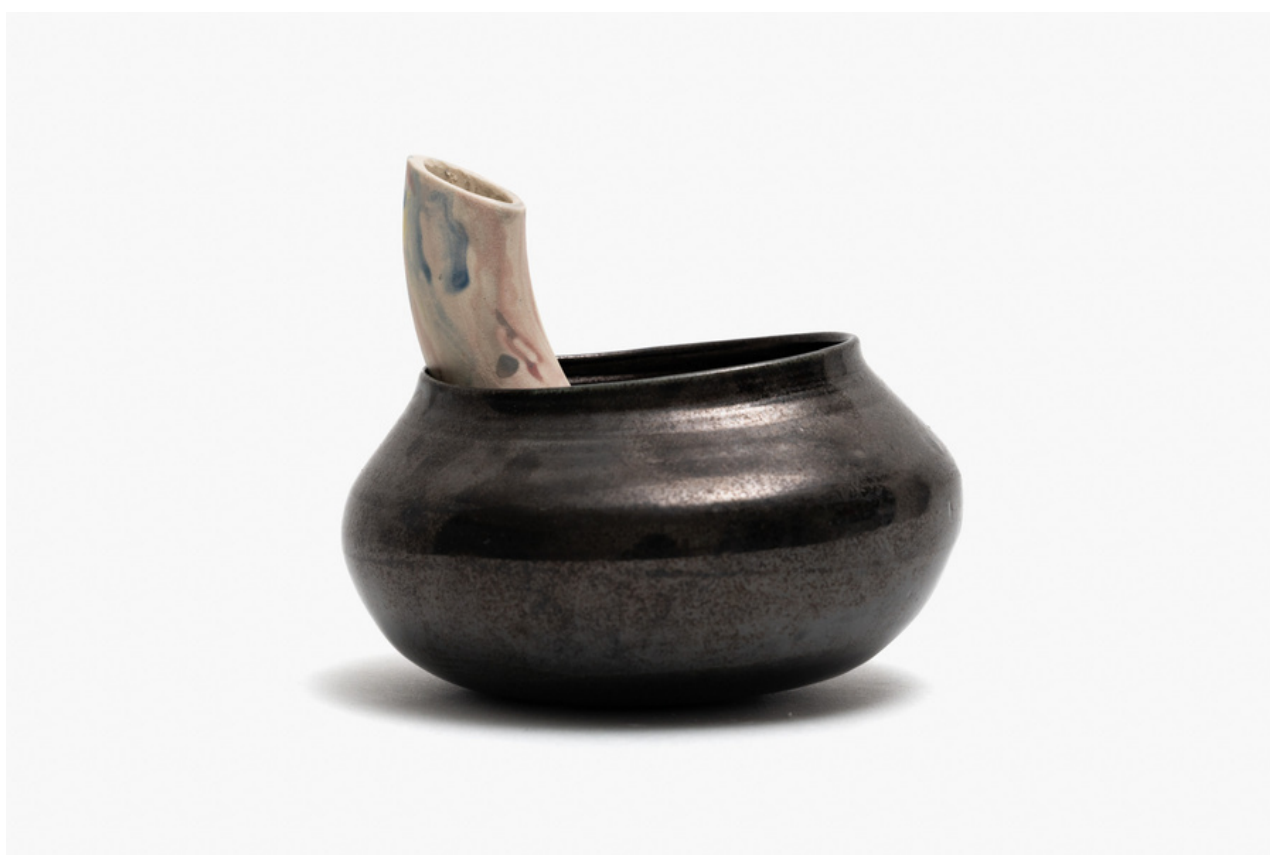
Bowl (1) 2023 stoneware with glaze & porcelain slip 12 x 15 x 14 cm $1,000.00