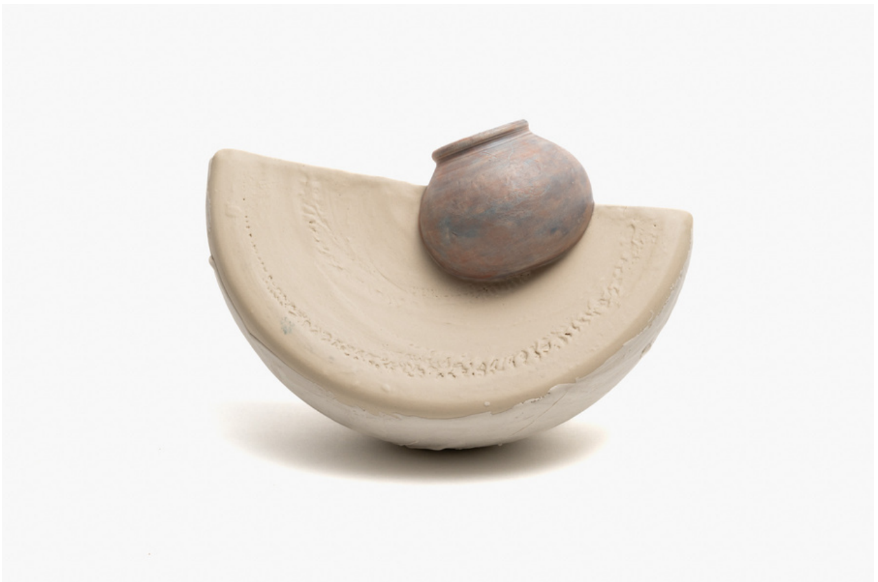
Inside 2023 stoneware with porcelain slip 15 x 22 x 10 cm $1,500.00