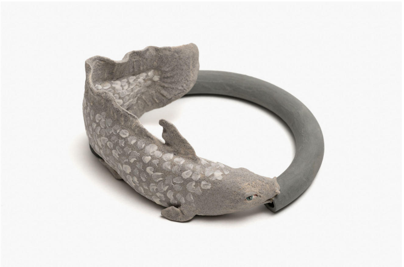
To Do With Nothing 2023 stoneware with porcelain slip 11 x 25 x 24 cm $2,500.00 RESERVED