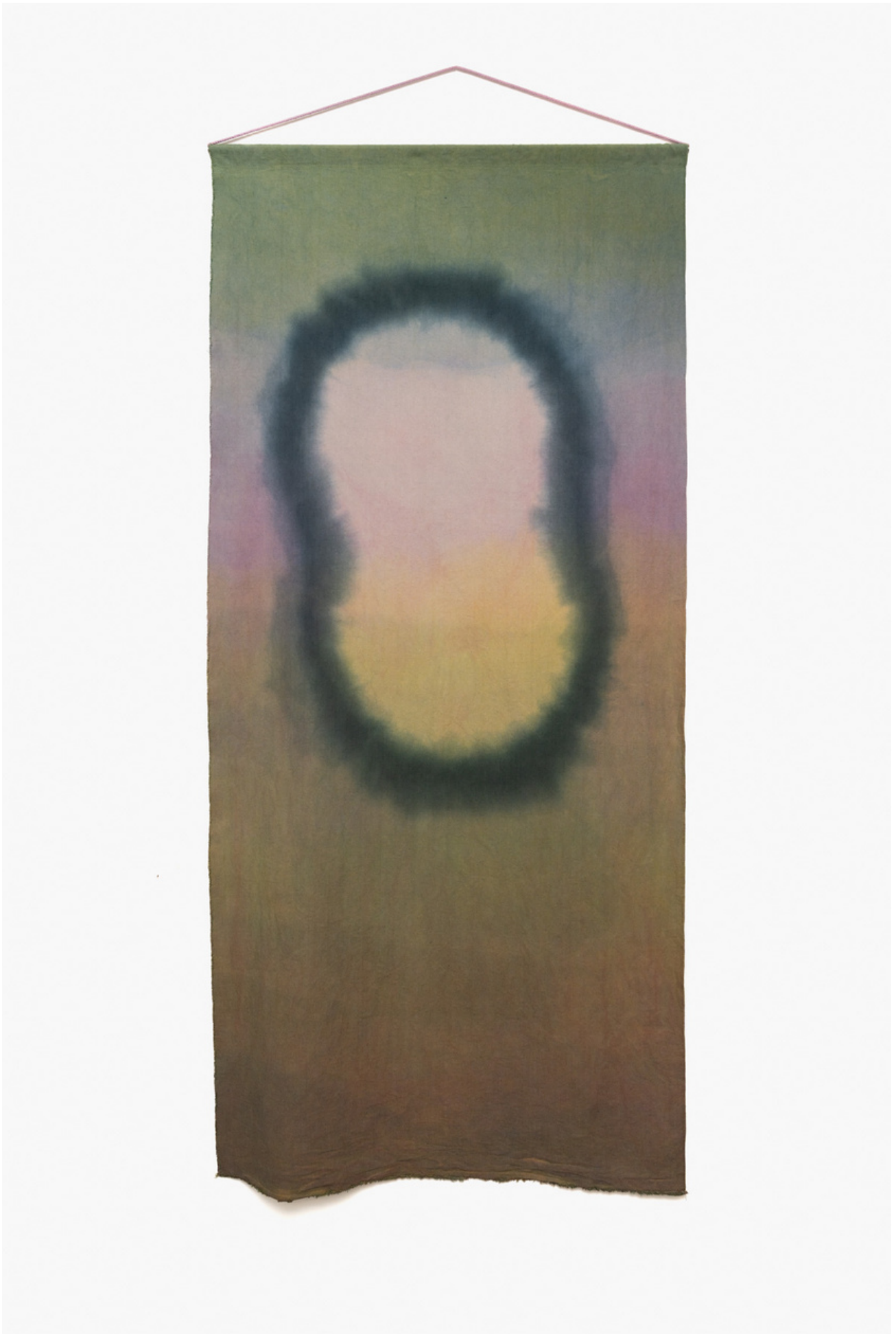
Opening (4) 2024 canvas & synthetic dye 188 x 88 cm $3,500.00