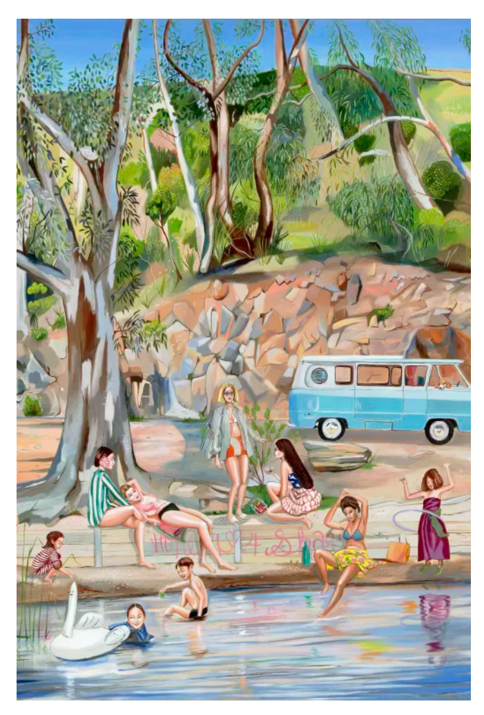
Single mums at the Res (after Hermann Corrodi)

"The original ... is a sensational painting in terms of looking at women," McHaffie says. "I wanted to draw it back to Castlemaine and pitch it around the local area ... We do have a lot of young, strong female role models around town that run local small businesses and support each other doing fun things for the kids."