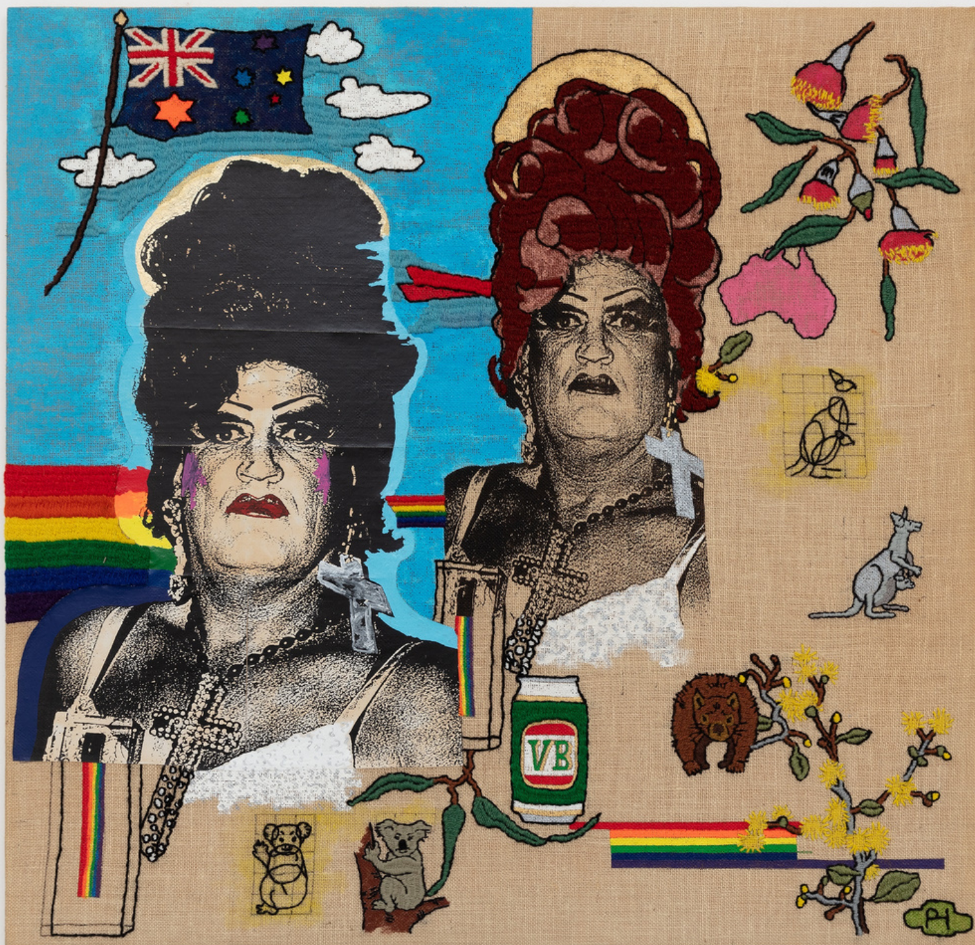
Dulcie, The Rainbow Award Australian Madonna 1996/7 wool sewings & photocopy collage on hessian 123 x 119 cm $9,500.00