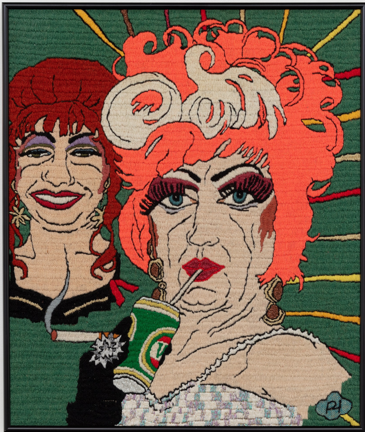
Dulcie and Lucy at Interval 1993 wool sewings on hessian 84 x 71 cm $6,500.00