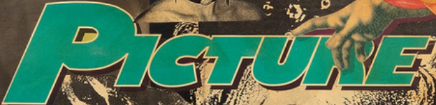
Produce of Australia 1997