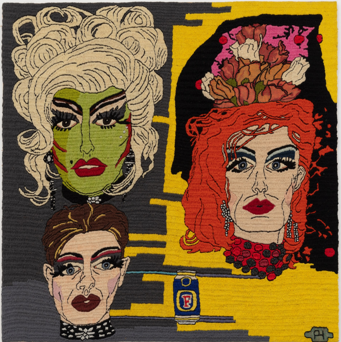
Drag Queen 1996 wool sewings on hessian 113 x 112 cm $9,500.00