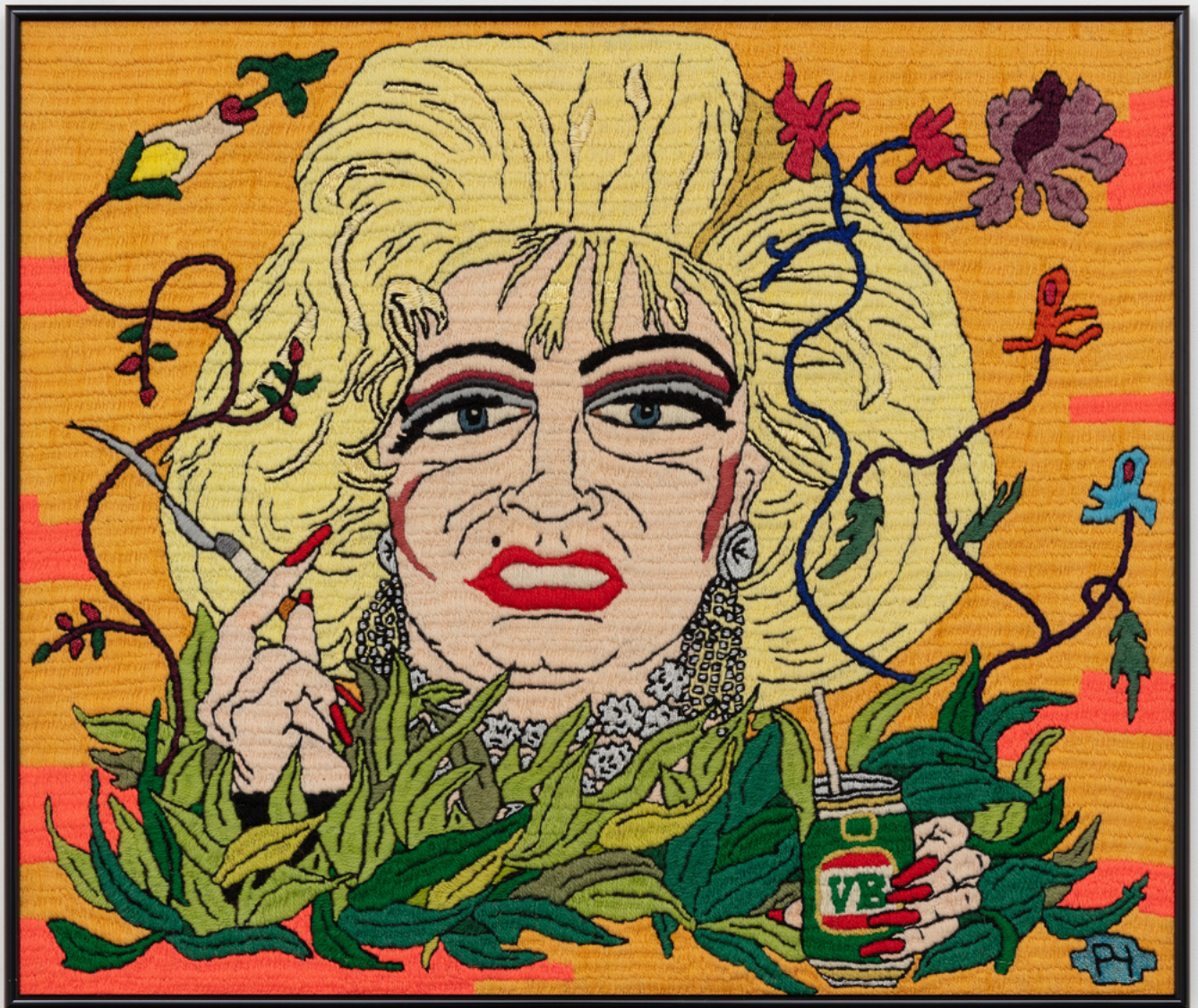
Miss Candee 1995 wool sewings on hessian 82 x 97 cm $6,500.00