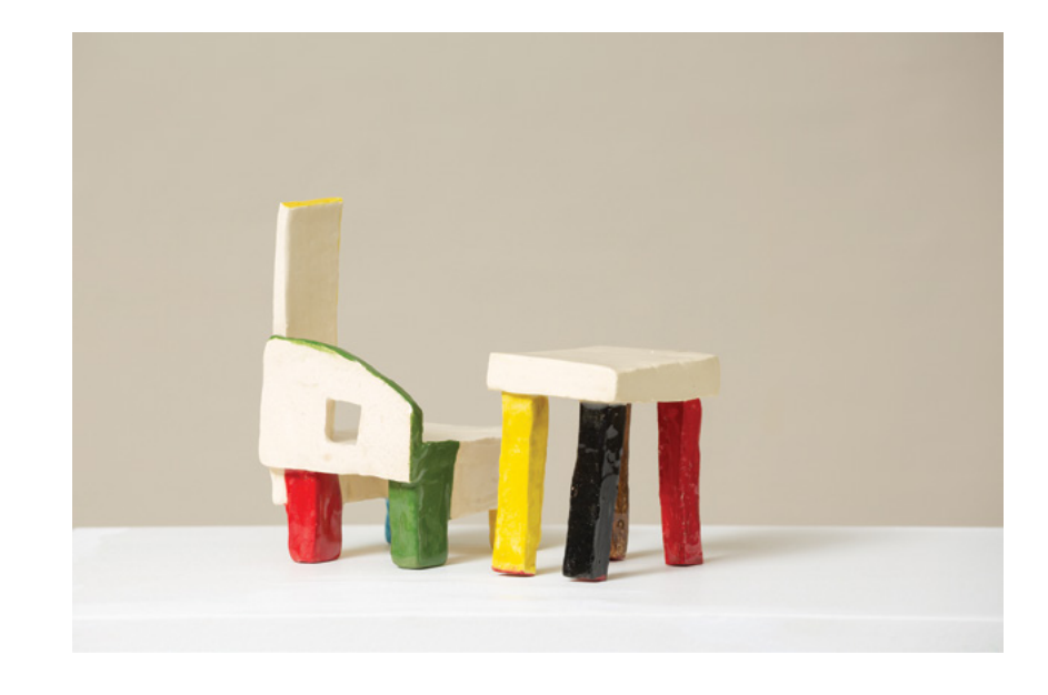
Chair and Table with Coloured Legs, 2020 ceramic 10.8 x 12 x 7.2 cm (COMBINED)