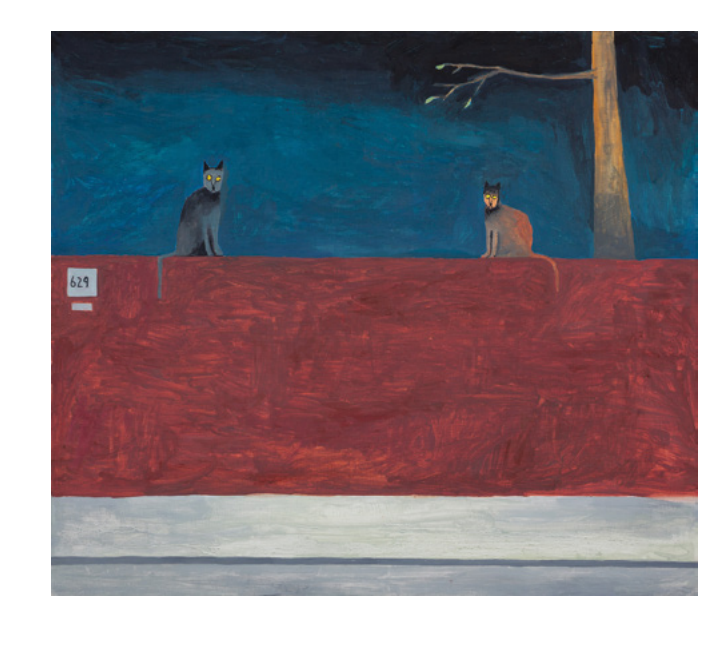
2 Cats on Wall, 2020 oil on plywood 36.6 x 44 cm