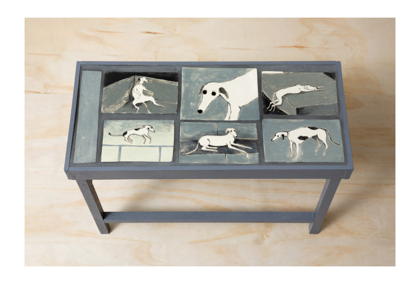
Greyhound Table, 2018 wood, glass, ceramic & enamel paint 36.5 \times 51.2 \times 23.4 cm