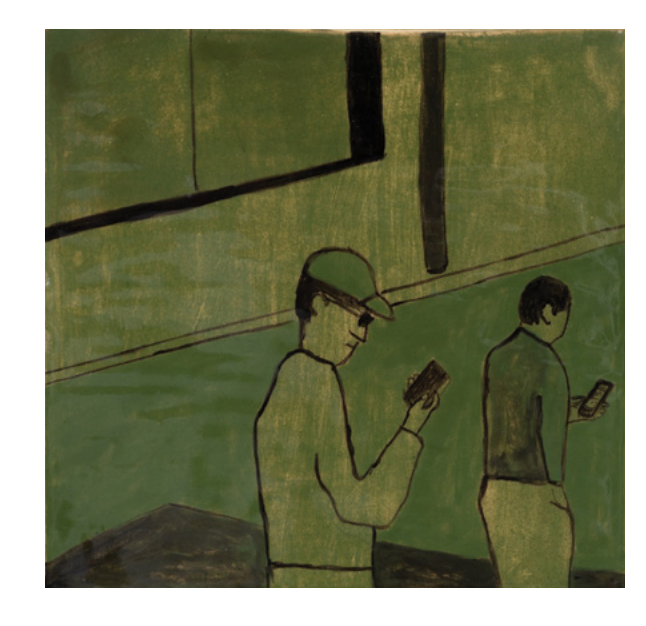
Waiting to Cross, 2020 ceramic tile 14.4 x 14.7 cm