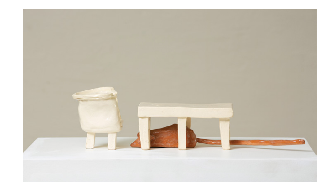
Chair, Table, Mouse, 2020 ceramic 7 x 20 x 6.5 cm (COMBINED)