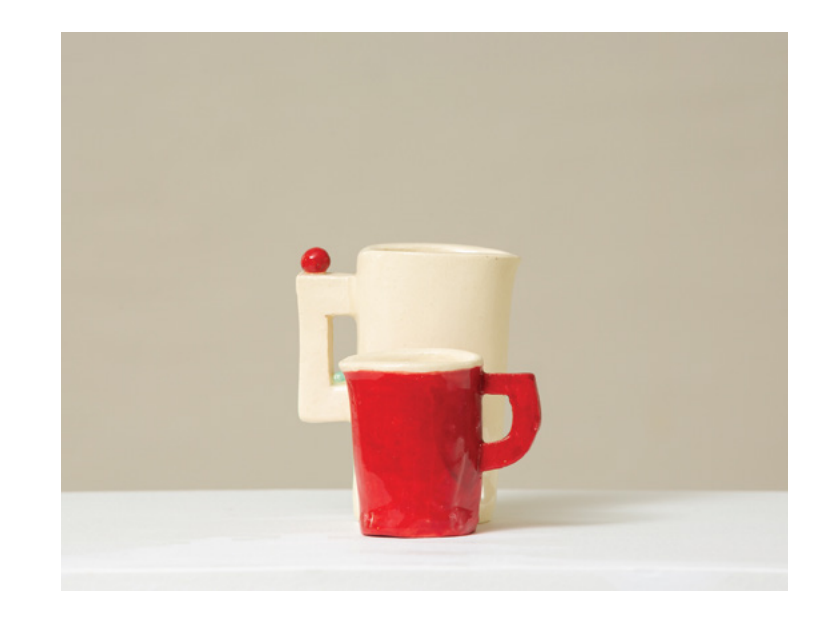
2 Red and White Jugs, 2020 ceramic 7.5 and 4.7 cm (H)