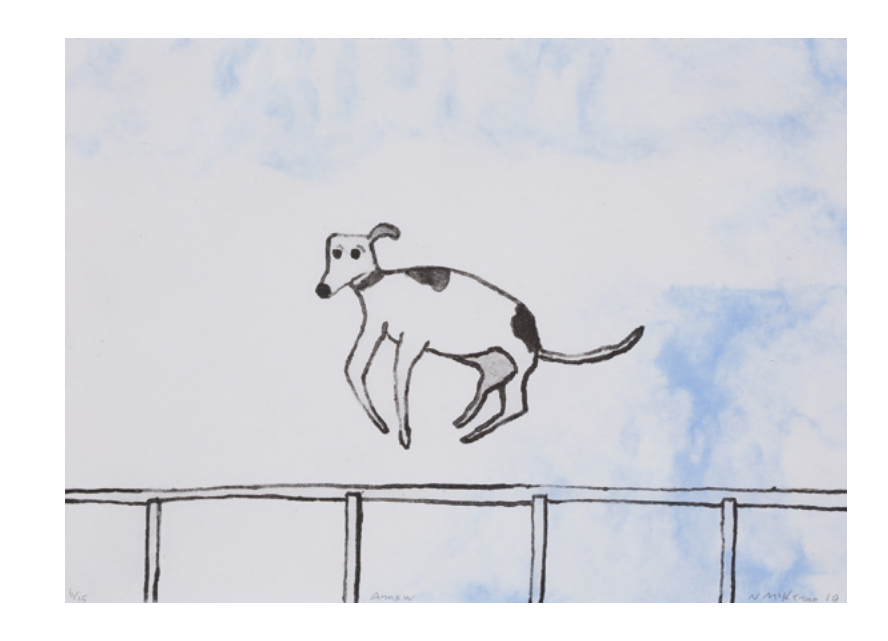
Anna W, 2019 lithograph 20.6 x 28.3 cm