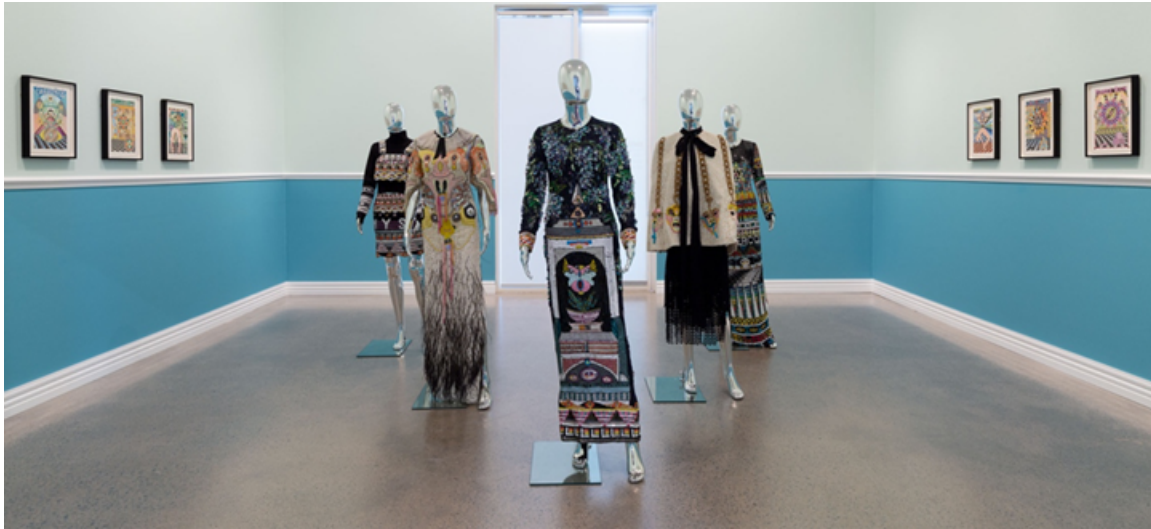
Exhibition view: Jess Johnson and Simon Ward, Terminus , Heide Museum of Modern Art, Melbourne (2 November 2019–1 March 2020).

When I had a look at the collection, I noticed the drawings, but other pieces seemed quite sculptural. It's intriguing how the artworks blend into the fashion collaboration.