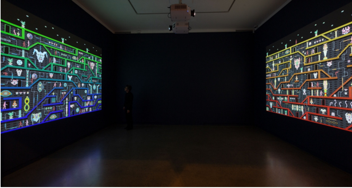
Exhibition view: Jess Johnson and Simon Ward, Terminus , Heide Museum of Modern Art, Melbourne (2 November 2019–1 March 2020).

I noticed that the elements in your work seem to cross over into different time periods. They have the contemporary and highly digitised elements, but also, the videos look like ancient Egyptian hieroglyphics that have been brought to life. The artworks seem to cross between these two completely polar opposite times in history.