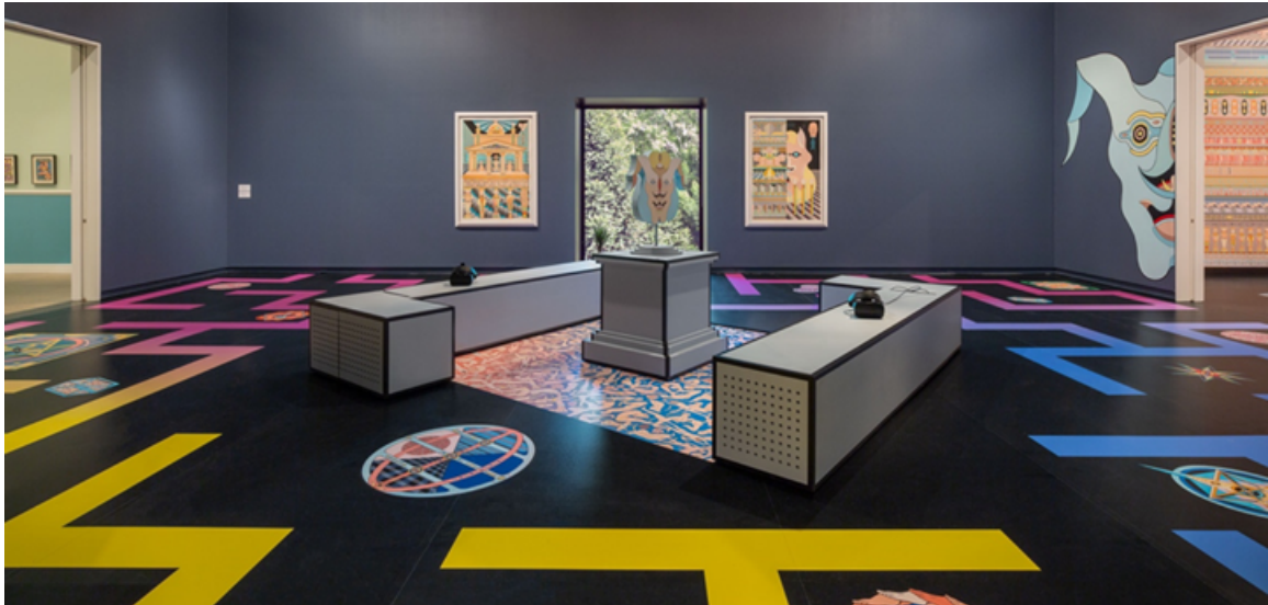
Exhibition view: Jess Johnson and Simon Ward, Terminus , Heide Museum of Modern Art, Melbourne (2 November 2019–1 March 2020).

fantasy. I actually got into art through the cover art on record sleeves, VHS tapes, and sci-fi books at second-hand bookstores.