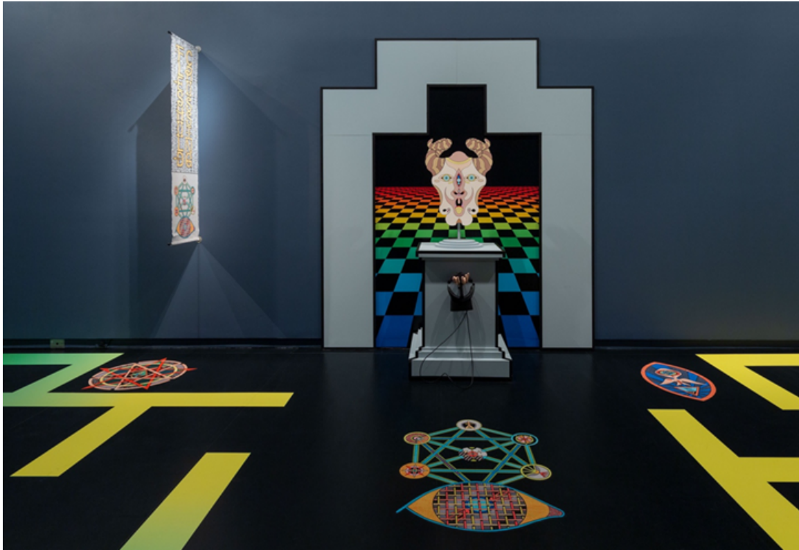
Exhibition view: Jess Johnson and Simon Ward, Terminus , Heide Museum of Modern Art, Melbourne (2 November 2019–1 March 2020).

comparable reference points in popular culture. It's been very fruitful. All of my drawings now feed into the collaborative work that we do together.