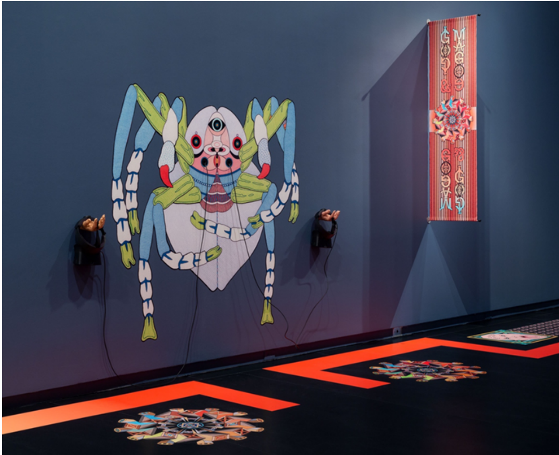
Exhibition view: Jess Johnson and Simon Ward, Terminus , Heide Museum of Modern Art, Melbourne (2 November 2019–1 March 2020).