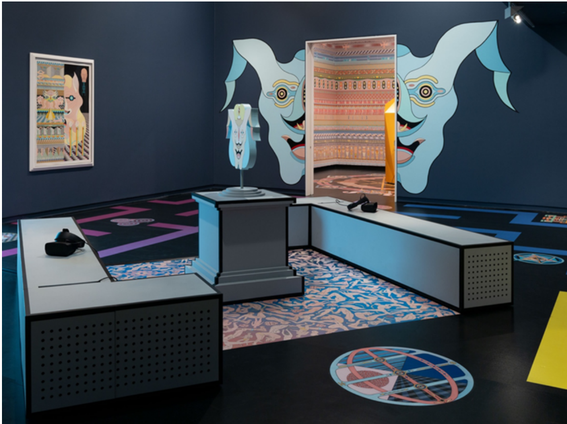
Exhibition view: Jess Johnson and Simon Ward, Terminus , Heide Museum of Modern Art, Melbourne (2 November 2019–1 March 2020).

drifting in and out of voids, orifices, and black holes. First exhibited at the National Gallery of Victoria, the installation took shape with Johnson's drawings and the V.R. artwork Ixian Gate (2015). The animation used Oculus Rift technology to provide the audience with 360-degree views of Johnson and Ward's parallel universes. Inspired by Frank Herbert's 1965 science-fiction novel Dune , the artwork reflects on machine culture and futuristic ideologies of technology—while creating an immersive space that begins with the installation in the gallery.