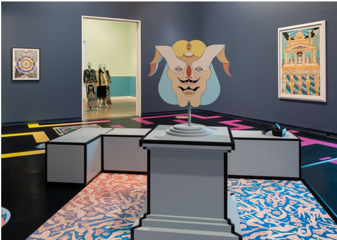
Exhibition view: Jess Johnson and Simon Ward, Terminus , Heide Museum of Modern Art, Melbourne (2 November 2019–1 March 2020).

isolating. I had a studio at this place called Tokyo Wonder Site, which sounds colourful and fun but was actually housed in a sterile office-type skyscraper. I had a little single room sleeping cubicle somewhere many floors up, and a studio a few floors below. I'd look out my window, and all I could see were other skyscrapers and people working in cubicles, and I remember one day when I was feeling a little crazy I tried to look around my whole view and see if I could see any patch of green and I couldn't, it was all buildings. All grey. Everyone living very solitary cubicle lives, and I was doing the same. I'd go down to the ground floor to the convenience store, Konbini, to get a bento box for dinner and go back up to my room to eat and days would go by when I didn't leave the building.