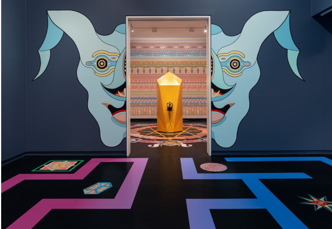
Exhibition view: Jess Johnson and Simon Ward, Terminus , Heide Museum of Modern Art, Melbourne (2 November 2019–1 March 2020).

of course, the election happened, and it felt quite apocalyptic for a while. I can look back at the drawings created during that residency, and while I try to refrain from saying my world is either a utopia or dystopia, the drawings that I was doing at that time feel more 'dense' with power and unease, perhaps leaning towards the dystopic more than any other works I've done.